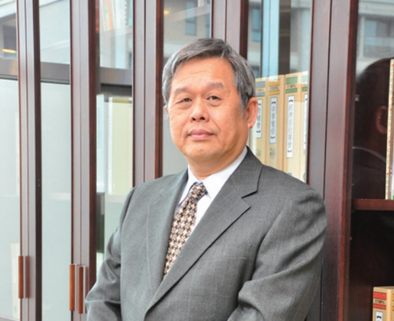
▲ Current CLA Minister Pan Shih-wei

and become the Ministry of Labor Retirement and Welfare Department and be responsible for policy planning and supervisory; while the Bureau of Labor Funds will be responsible for pension fund management