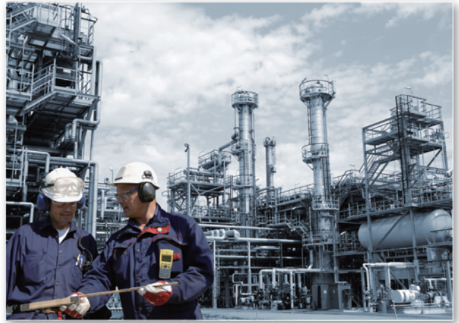
▲ The government ensures labor rights and interests to stabilize labor-management relations

However, for some enterprises that do not have low salary worker cost special requirement, the new 'add the Employment Stability fee, increase the foreign worker quota' mechanism has been formulated, and has been planned in accordance with caution and keeping foreign worker salaries close to those of Taiwan workers. Under this premise, the Council of Labor Affairs has agreed that enterprises that increase the number of foreign workers they hire by "5% and below", "6-10%", and "11- 15%" will be required to pay an additional employment security fees of NT$3,000, NT$5,000, and NT$7,000 respectively. In order