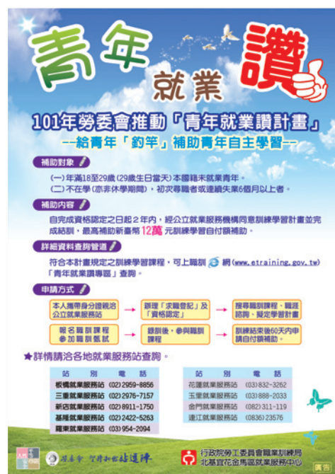
▲ The poster of Guidelines for the Youth Employment Subsidy

Although the Guidelines for the Youth Employment Subsidy