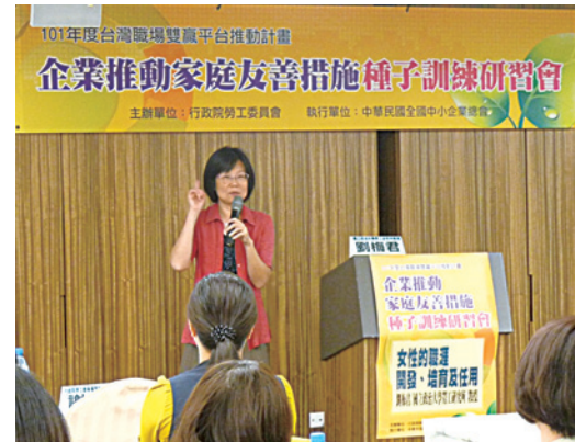
▲ The government holds training seminars to share enterprise family friendly measures