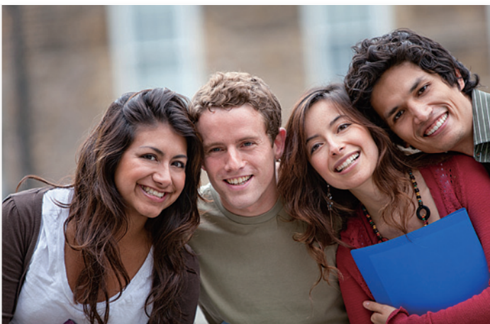
▲ The government has deregulated the provision of foreign students staying in Taiwan after graduation

In view of the raise talent, keep talent idea, the Council of Labor Affairs issued a regulation on June 14 2012. The regulation states that foreign students, overseas Chinese, and ethnic Chinese students, that graduated from a public or registered private university in Taiwan on or after the school year of 2011, are permitted to undertake specialized and technical jobs, providing that their average monthly salary is NT$37,619 or above. They are not required to have two years work experience.