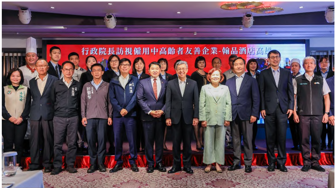
Image 7: Premier Chen Chien-jen (front row, 5 th from the right) and Minister of Labor Hsu Ming-chun (front row, 4 th from the right) visited Chateau de Chine Kaohsiung to encourage businesses to make the best use of older workers.

15.08.2023 In response to the challenges posed by the aging population and declining birth rates in Taiwan, Premier Chen Chien-jen and Minister of Labor Hsu Ming-chun visited Chateau de Chine Kaohsiung, a hotel which has been recognized as an age-friendly employer. The official visit aimed to highlight the utilization of older workers and senior citizens in the workforce, emphasizing the importance of collaborative efforts between businesses and the government to create a friendly employment environment.