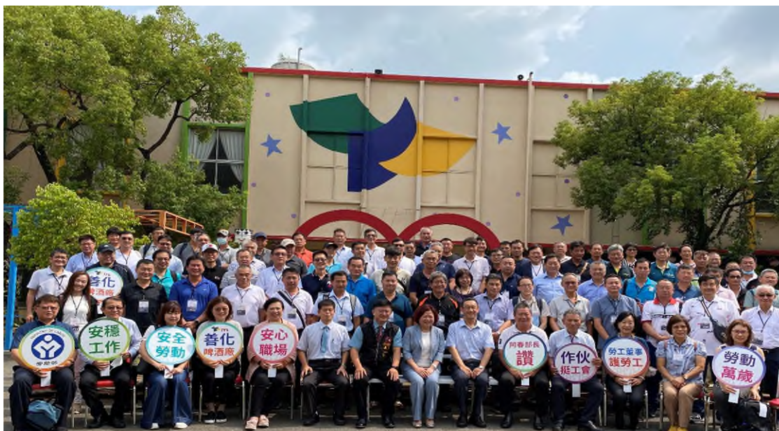
Image 9: Minister Hsu Ming-chun, together with the labor directors and the chairpersons of their affiliated labor unions, visited the Tainan Shanhua Brewery of Taiwan Tobacco and Liquor Corporation.