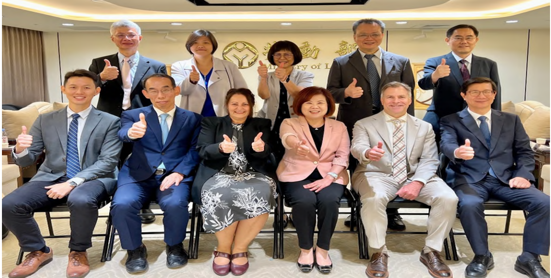
Image 2: Minister Hsu Ming-chun personally receives international attendees during the international conference.