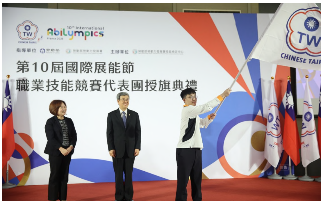
Image 9: President Chen Chien-Jen of the Executive Yuan and Minister Hsu Ming-Chun presenting the flag to National Representative You Chun-Sheng