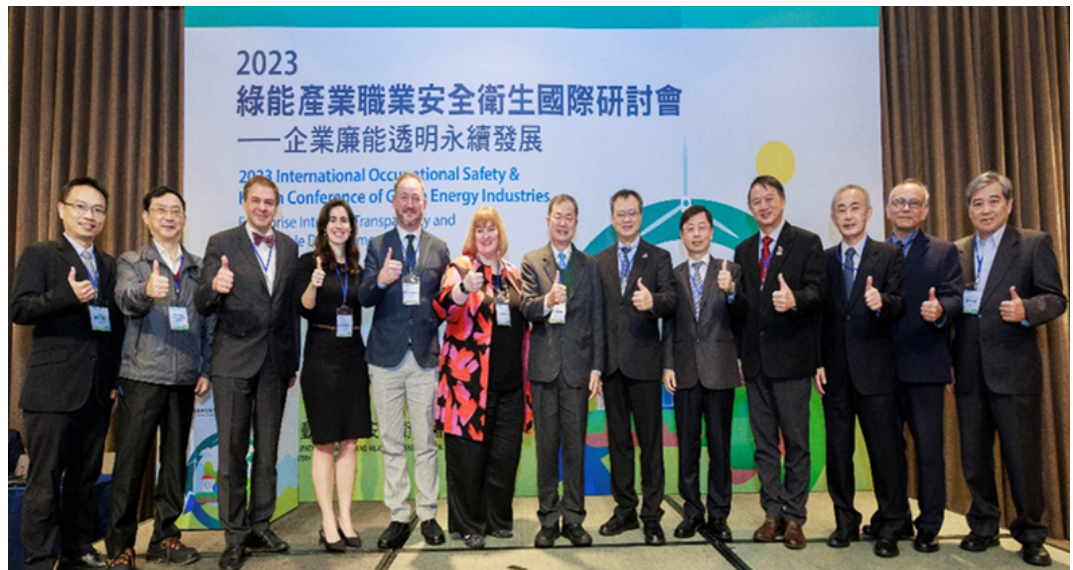
Image 12: The “2023 International Seminar on Green Energy Industry Safety and Health” invited domestic and international experts to share insights into the development trends and practical approaches in occupational safety and health within the green energy industry.

The MOL organized the “2023 International Seminar on Green Energy Industry Safety and Health”, and invited experts and scholars from various countries, including the UK Health and Safety Executive, the Federal Institute for Occupational Safety and Health of Germany, the International Association of Labour Inspection, the High-Pressure Gas Safety Institute of Japan, CSBC-DEME Wind Engineering, Synera Renewable Energy, and Ørsted, among others, to share their insights. Representatives from the British Office Taipei, the German Institute Taipei, and senior executives from Taiwan's green energy industry also attended. The focus was on offshore wind energy, solar photovoltaics, and hydrogen safety, with the aim of enhancing occupational safety and health standards in Taiwan's green energy industry.