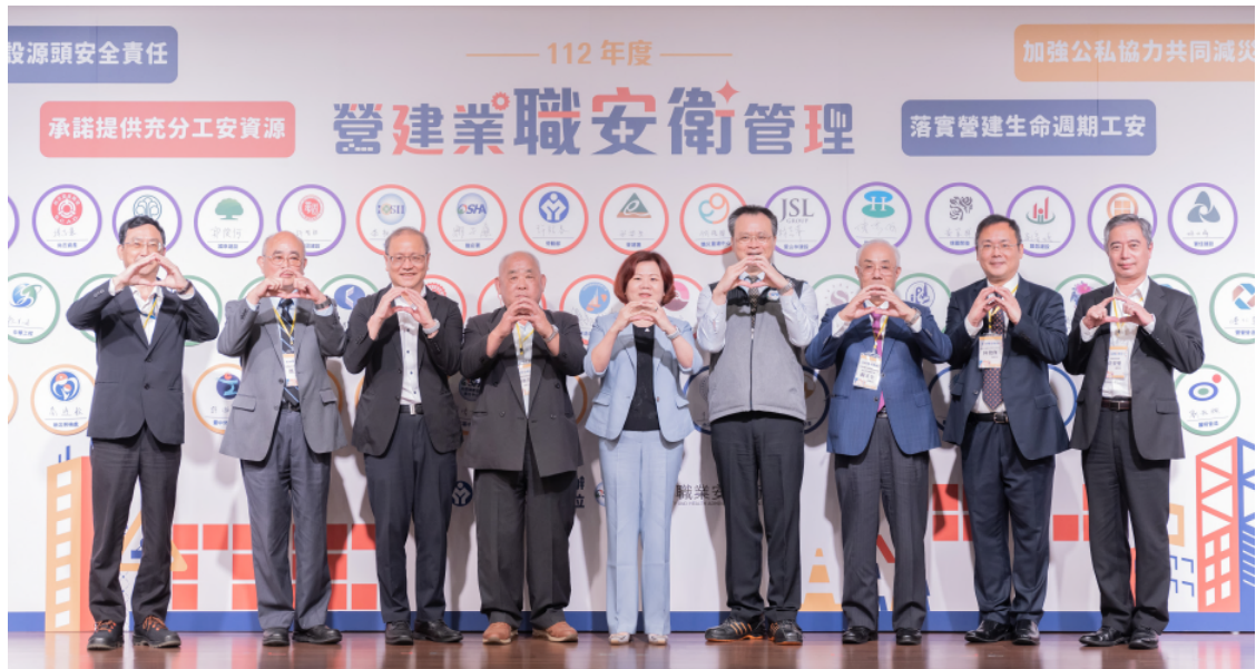
Image 6: Minister Hsu Ming-chun and representatives from the construction industry jointly signed a disaster reduction pledge, aiming for zero workplace accidents in construction projects.

executives from real estate development companies, construction firms, and related industry groups jointly declaring a disaster reduction commitment and pledging to safeguard the occupational safety of the construction workplace.