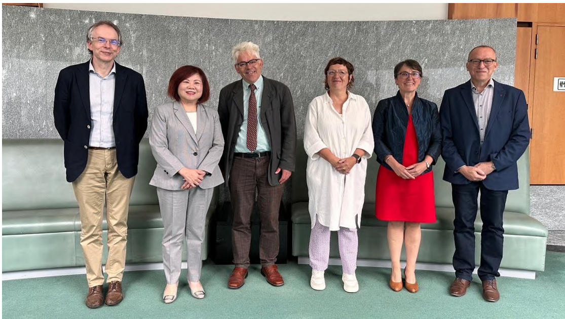
Image 13: Minister Hsu Ming-chun and the Chairman of the Belgian National Labour Council (3rd from the left) and others posing for a photo.