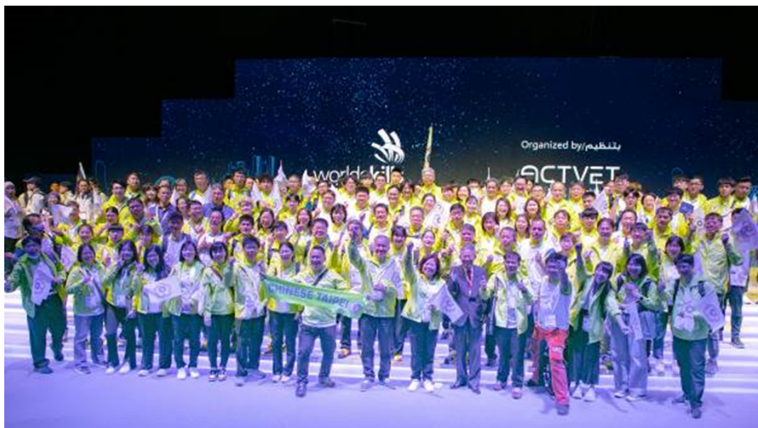
Image 9: Group photo of the Taiwan delegation during the WorldSkills Asia Abu Dhabi 2023 Competition