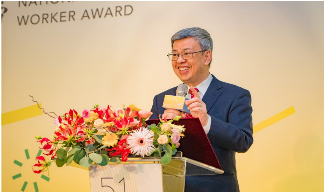
Image 3: Premier Chen Chien-jen delivered a speech at the “2023 Labor Day and National Model Worker Award Ceremony”