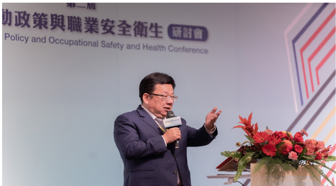
Image 8: At the opening ceremony of the 2nd Labor Policy and Occupational Safety and Health Conference, MOL Deputy Minister Lee Chun-yi delivered the opening speech.

25.05.2023 In response to the “construction site tower crane dismantling operations accident that caused a boom to crash and collide with the Taichung Metro tracks”, the MOL initiated a comprehensive labor inspection of major projects adjacent to rail lines and large-scale engineering projects requiring the use of tower cranes. A total of 38 sites were inspected (7 projects adjacent to rail lines, 38 major projects with tower crane operations). A total of 159 violation items were identified, with work suspension orders issued at 18 places, and fines totaling NT$5.5 million imposed.