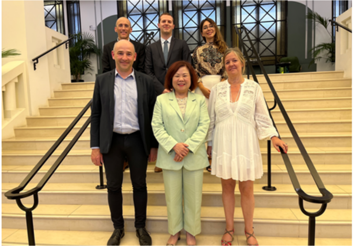
Image 14: Minister Hsu Ming-chun and the Representative of Worldskills France (1st from the left in the front row) and others posing for a photo.

30.06.2023 In response to the impact of the current economic situation on labor, leading to reduced working hours under labor-employer agreements, the “Employment Insurance Promotion of Employment Implementation Regulations” were amended and promulgated to adjust the criteria for activating stable employment measures, the implementation period, eligibility criteria for applicants, and the standard of payments. The amendments aim to stabilize employment and reduce unemployment, such as by providing subsidies to make up for differences in partial wages during the period of reduced working hours.