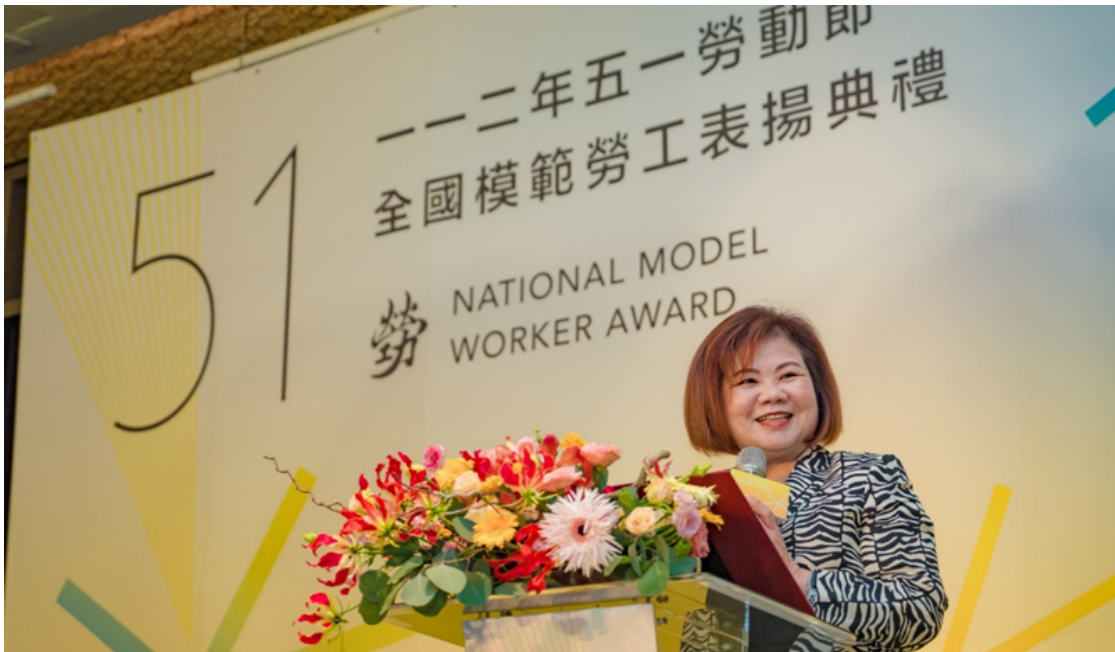
Image 4: Minister of Labor Hsu Ming-chun delivered a speech at the “2023 Labor Day and National Model Worker Award Ceremony”