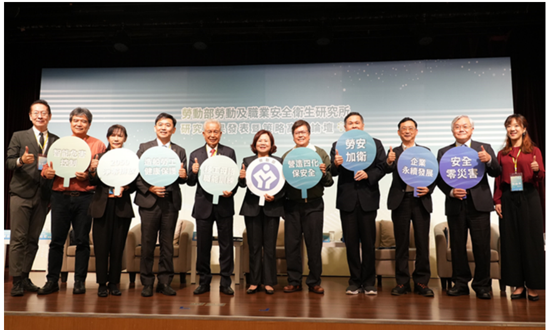
Image 2: Minister Hsu Ming-Chun, along with distinguished attendees, at the “High-Level Research Strategy Forum,” posing for a commemorative photo.