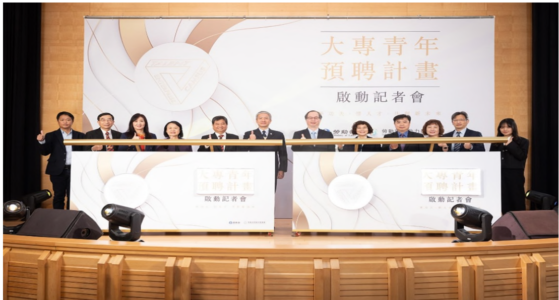
Image 1: MOL Vice Minister Chen Ming-jen, Director General of the WDA Tsai Meng-liang, and representatives of key industries, youths from universities and colleges and other VIPs attended the kick-off ceremony at the press conference.

10.01.2023 Counseled Penghu Huimin Hospital to become the first occupational injury and disease clinic network hospital in the offshore islands, declaring the commitment to jointly protect the physical and mental health of workers in the offshore islands.