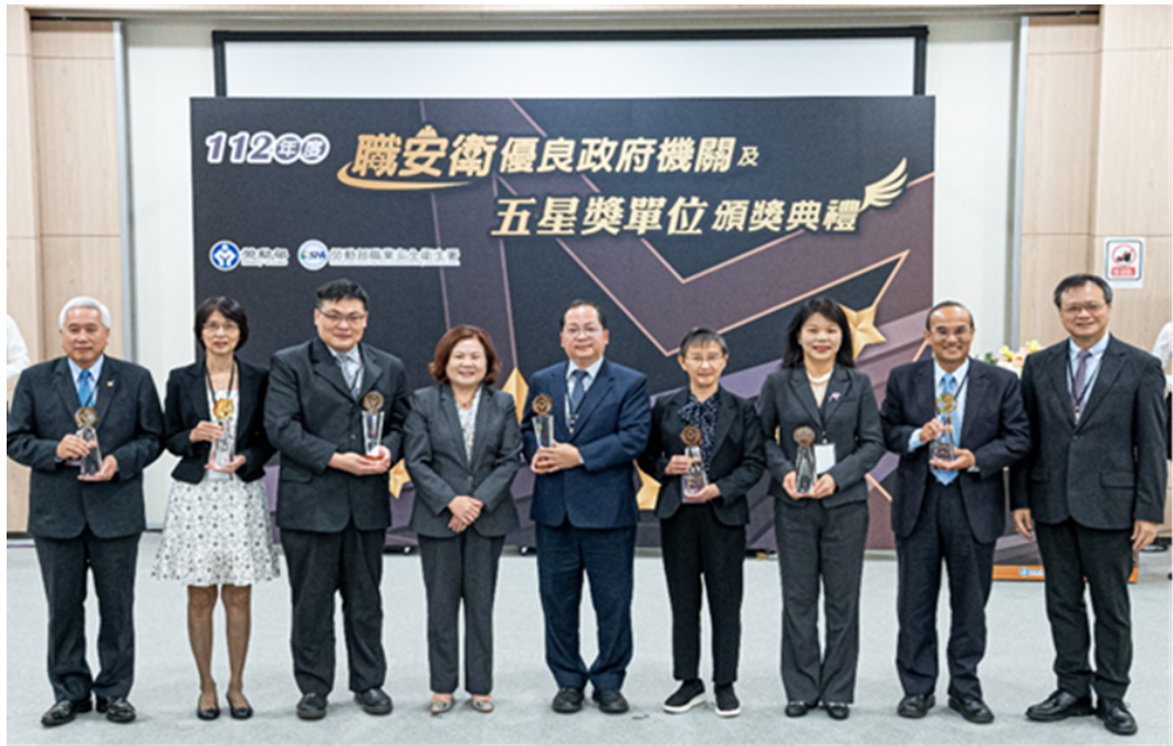
Image 6: Minister Hsu Ming-Chun with outstanding central government agencies in occupational safety and health.

continue fostering a culture of occupational safety and health and collaborate in creating a high-quality workplace environment.