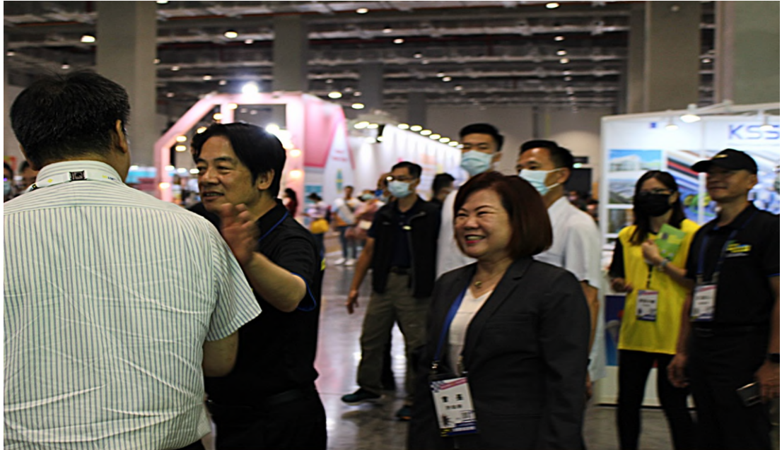
Image 4: Minister of Labor Hsu Ming-chun accompanied Vice President Lai Ching-te participating to participate in the occupational safety and health facility observation and experiential activities

14.07.2023 Occupational safety and health facility observation and experiential activities were integrated with the 53rd National Skills Competition, focusing on high-risk machinery and equipment operations, including aerial work platforms, forklifts, and collaborative robots (cobots). These activities employed practical operations, virtual reality (VR), augmented reality (AR), and other experiential teaching methods to enhance the awareness of occupational safety and health among workers. Vice President Lai Ching-te and Minister of Labor Hsu Ming-chun both highly commended these efforts.