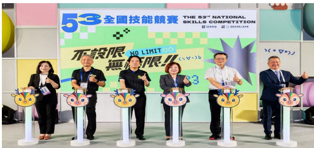
Image 1: Vice President Lai Ching-te and Minister of Labor Hsu Ming-chun jointly inaugurated the Skills Fun Park