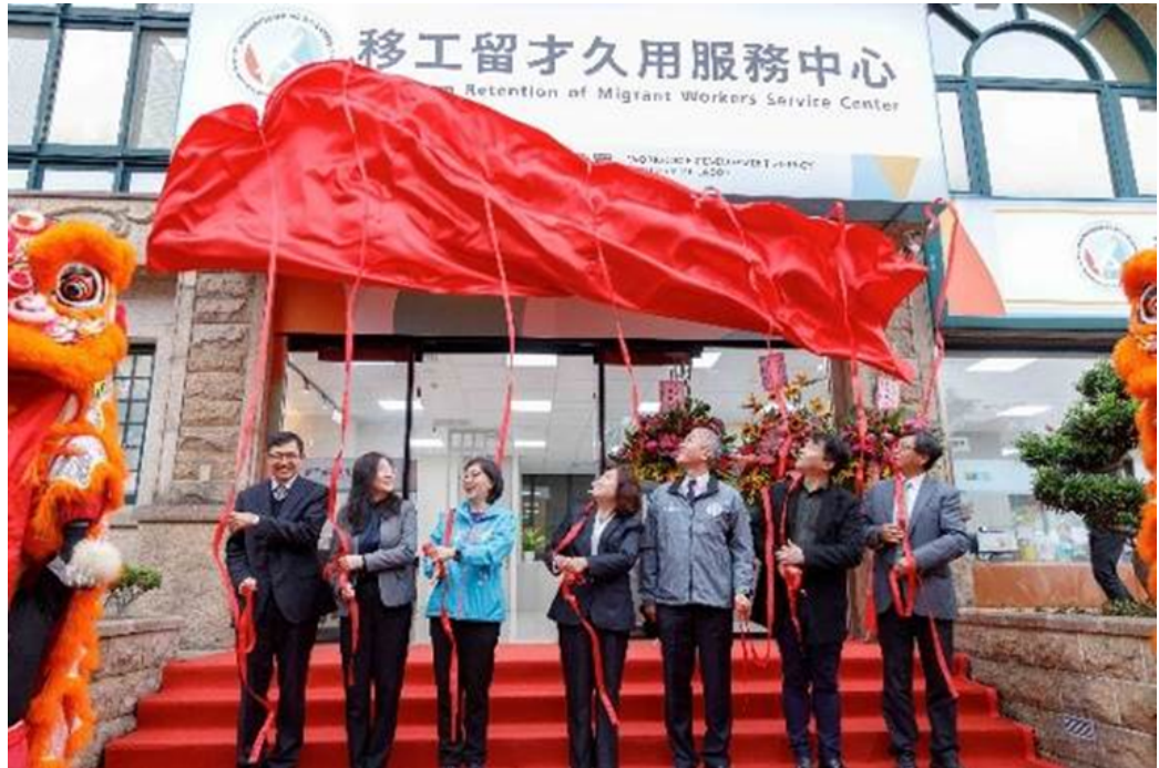
Image 16: Minister Hsu Ming-Chun (4th from the right), Director-General Tsai Meng-Liang of the Workforce Development Agency (3rd from the right), and honored guests jointly unveiled the “Long-Term Retention of Migrant Workers Service Center.”

The “Long-Term Retention of Migrant Workers Service Center” was established to provide services such as obtaining necessary documents for employers before applying for mid-level technical manpower, clarifying ongoing cases, and providing guidance and support for retention after hiring. It serves to address employers' doubts regarding the hiring of mid-level technical workers and offers high-quality and convenient services.