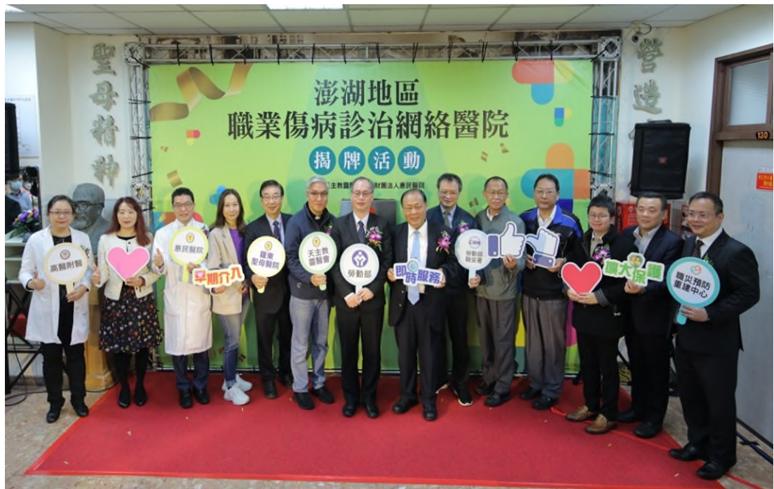
Image 2: Vice Minister Chen Ming-jen, Penghu County Magistrate Chen Kuang-fu and Huimin Hospital President Chang Ming-Che jointly unveiled the plaque.

10.01.2023 Counseled Penghu Huimin Hospital to become the first occupational injury and disease clinic network hospital in the offshore islands, declaring the commitment to jointly protect the physical and mental health of workers in the offshore islands.