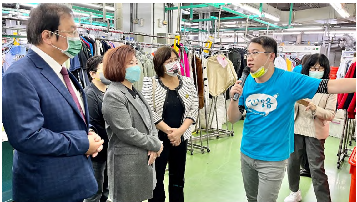
Image 11: Minister Hsu Ming-chun, legislators Chiu Tai-yuan and Wu Yu-chin visit the Tsz-You Sheltered Workshop

27.03.2023 The Social Welfare and Environmental Hygiene Committee of the Legislative Yuan visited Tsz-You and Tsz-Yu Sheltered Workshops and the New Taipei City Vocational Rehabilitation Service Center for the Physically and Mentally Disabled to learn about the implementation of vocational rehabilitation services and to exchange views on the development of vocational rehabilitation services for the physically and mentally disabled after the visit.