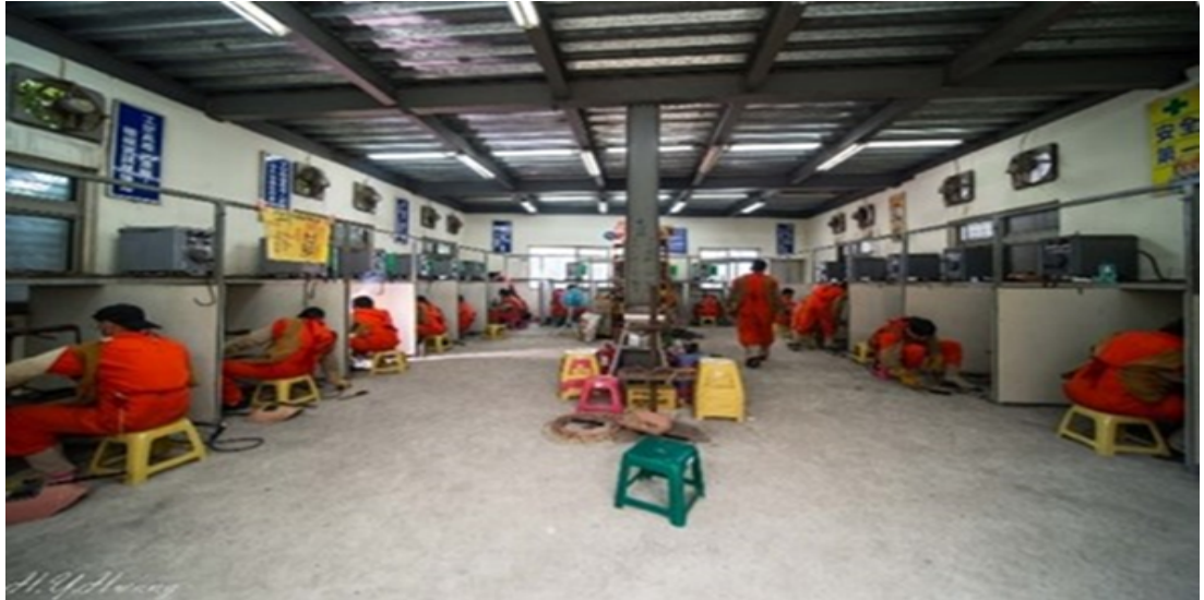
Image 9: Trainees during dry welding training in an onshore classroom.