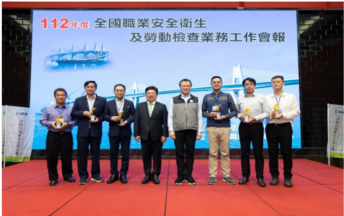
Image 6: During the “2023 Labor Inspection Agency Performance Evaluation”, Vice Minister Lee Chun-yi presented awards to the top-performing units