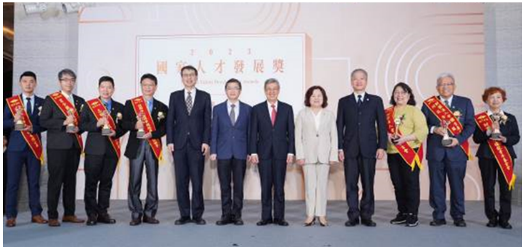
Image 14: Group photo at the 2023 National Talent Development Awards Ceremony.