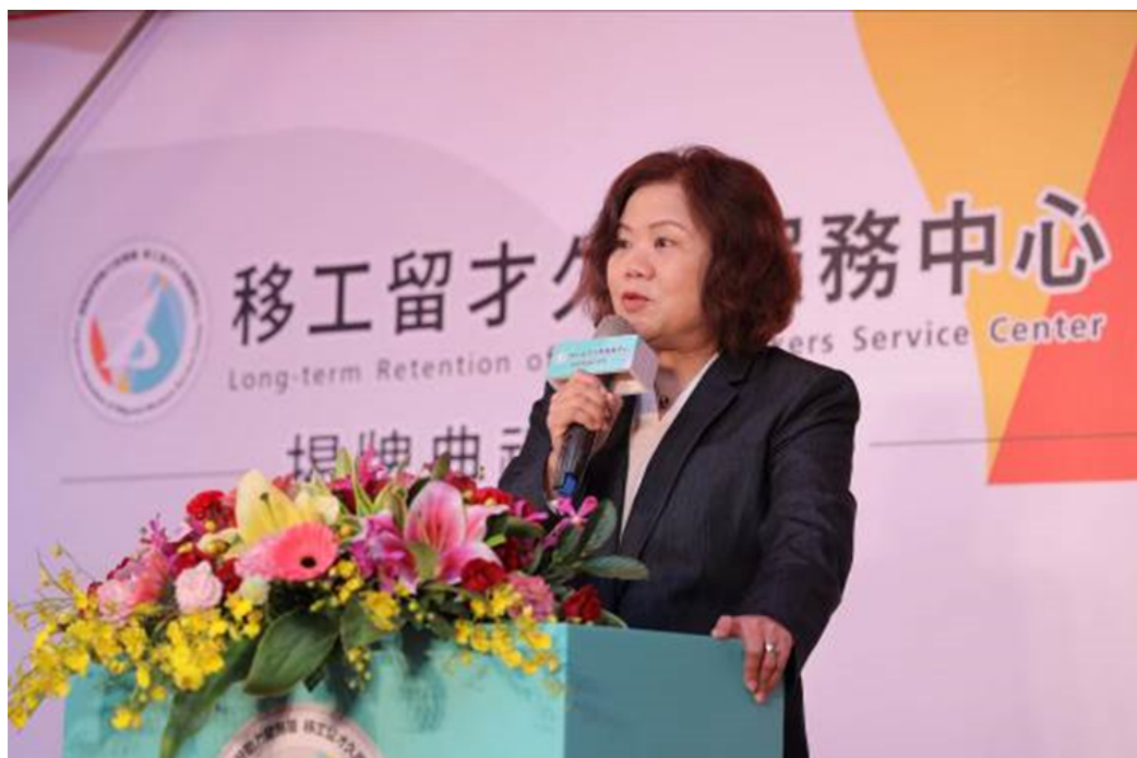
Image 18: Minister Hsu Ming-Chun delivering a speech at the inauguration ceremony of the “Long-Term Retention of Migrant Workers Service Center.”