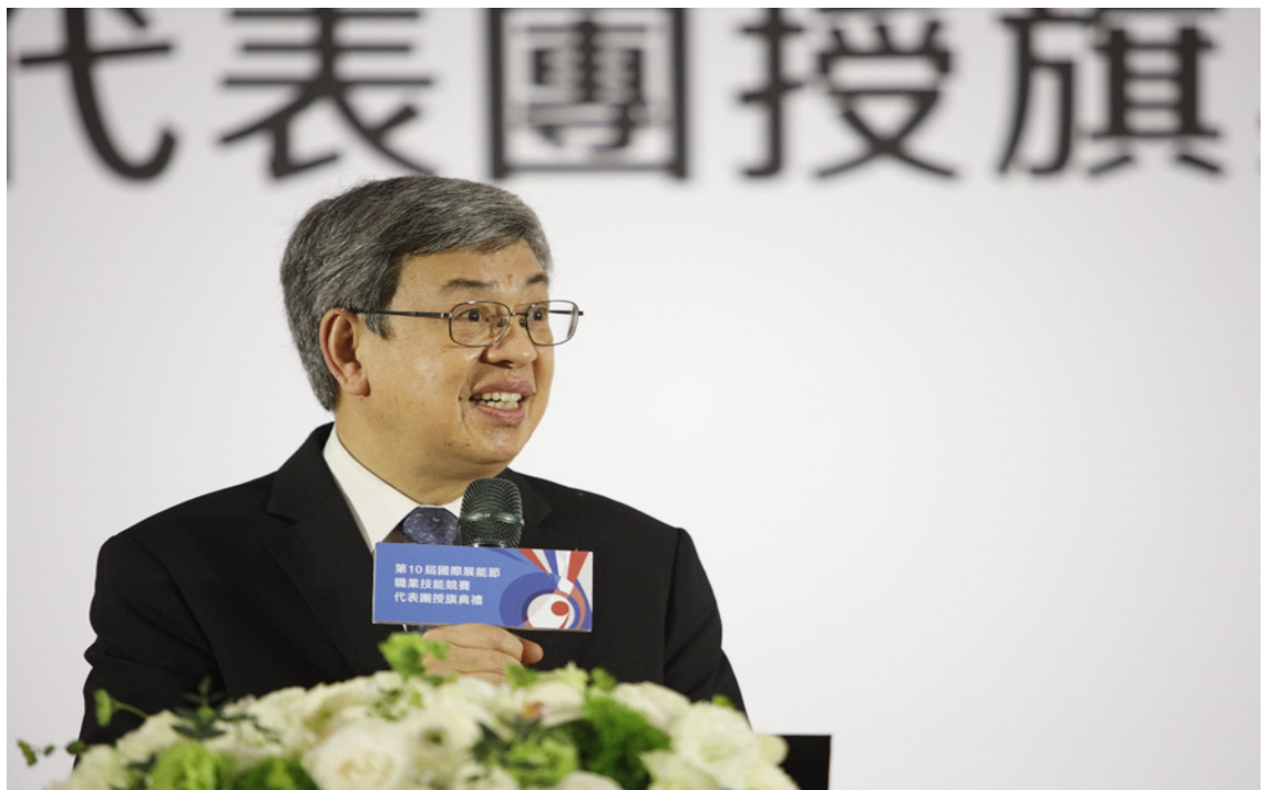
Image 8: President Chen Chien-jen of the Executive Yuan personally attended the 10th International Abilympics Competition Flag Presentation Ceremony