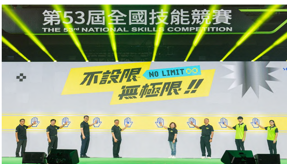
Image 2: Premier Chen Chien-jen and Minister of Labor Hsu Ming-chun unveiled the opening ceremony of the 53rd National Skills Competition