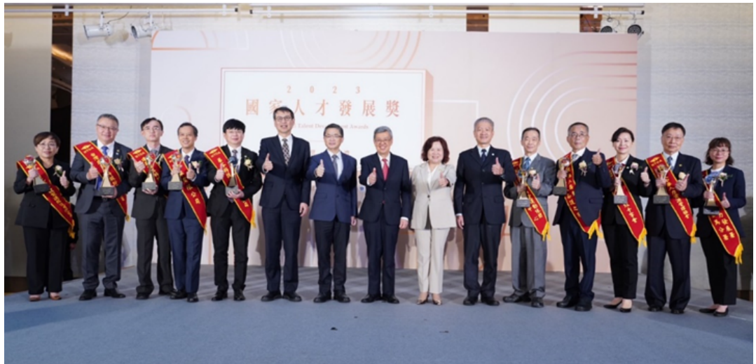
Image 13: Group photo at the 2023 National Talent Development Awards Ceremony.