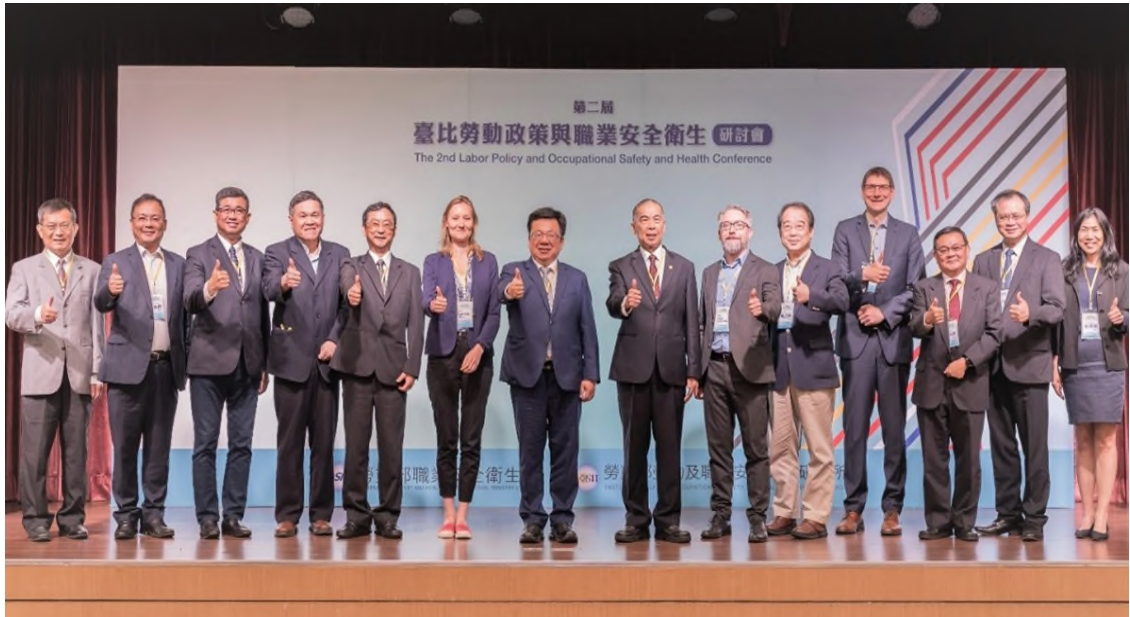
Image 7: MOL Deputy Minister Lee Chun-yi in group photo with attendees, including HIVA researchers, during the opening ceremony.

Chun-yi of the MOL. In addition, researchers from the HIVA Research Institute for Work and Society at KU Leuven, Belgium, and experts and scholars from related fields were invited to exchange ideas on topics such as net-zero transition, labor, and occupational safety and health.