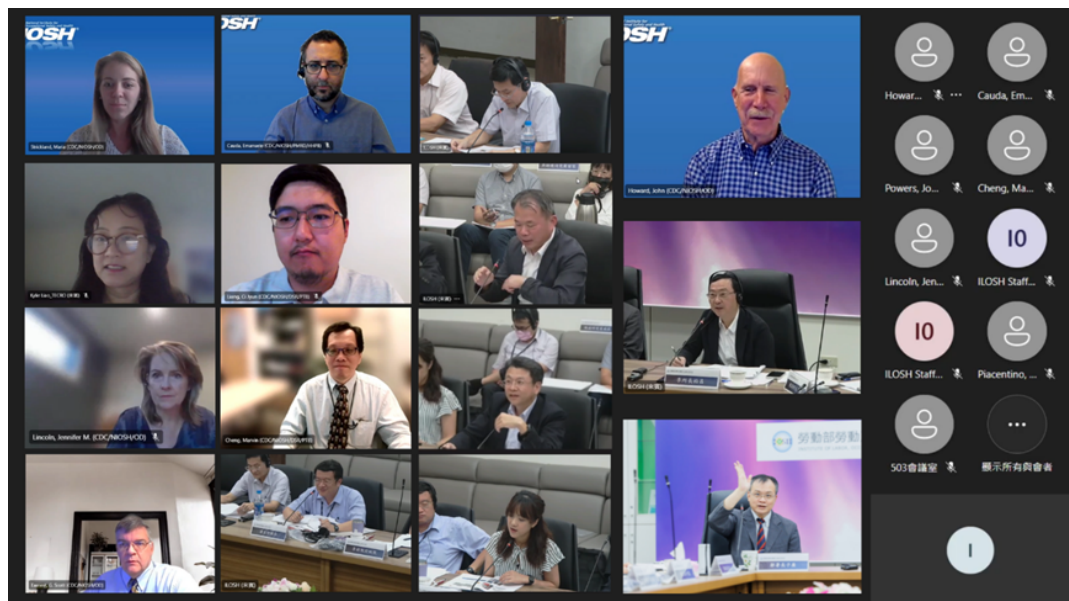
Image 1: Hosting of the “2023 International Research Collaboration Exchange Meeting between ILOSH and NIOSH.”