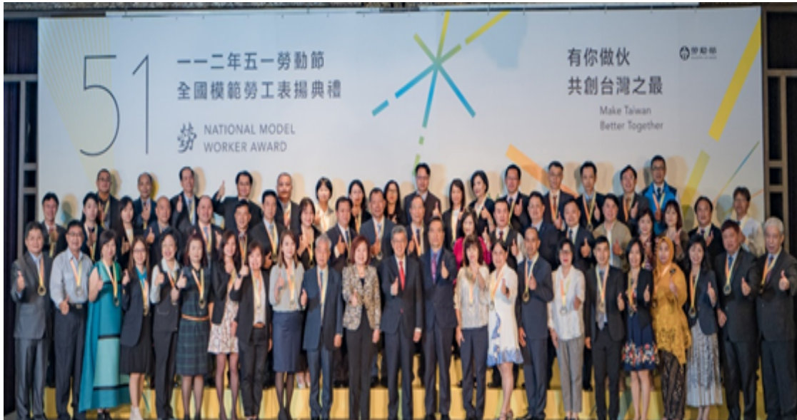
Image 5: Premier Chen Chien-jen and Minister Hsu Ming-chun in a group photo with 56 model workers attending the event