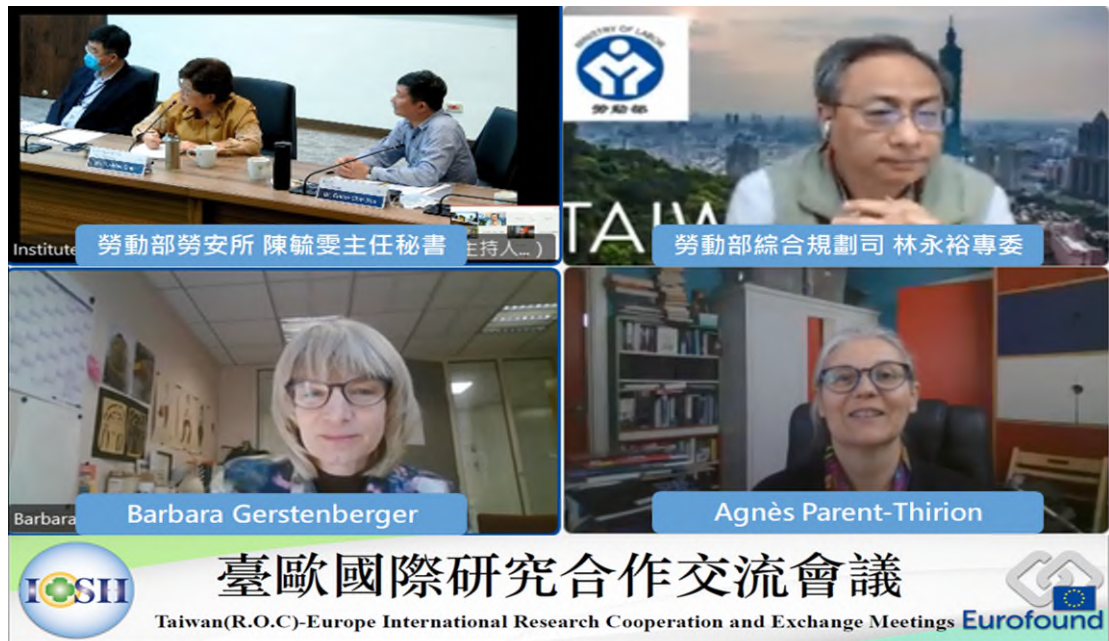
Image 10: The Institute of Labor and Occupational Safety and Health and the European Foundation for the Improvement of Living and Working Conditions (Eurofound) jointly organized the 1st Taiwan-Europe International Cooperation and Research Exchange Conference (video conference), which focused on the issues of the Taiwan-Europe Working Conditions Survey, including the arrangement of the implementation schedule, the design of the questionnaire and the presentation of the survey results.

27.03.2023 The Social Welfare and Environmental Hygiene Committee of the Legislative Yuan visited Tsz-You and Tsz-Yu Sheltered Workshops and the New Taipei City Vocational Rehabilitation Service Center for the Physically and Mentally Disabled to learn about the implementation of vocational rehabilitation services and to exchange views on the development of vocational rehabilitation services for the physically and mentally disabled after the visit.