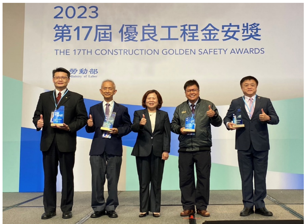
Image 8: Minister Hsu Ming-Chun presenting awards to the High Distinction award-winning project teams.