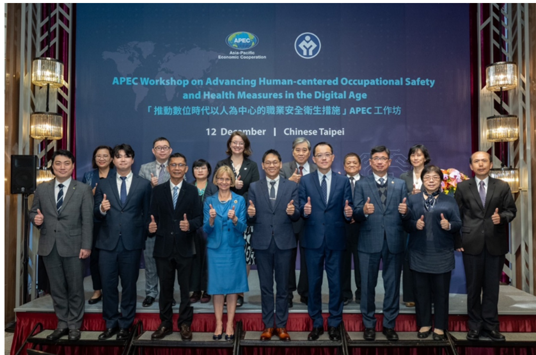
Image 21: MOL Deputy Minister Wang An-Pang (center of the first row), in a group photo with dignitaries at the opening ceremony.