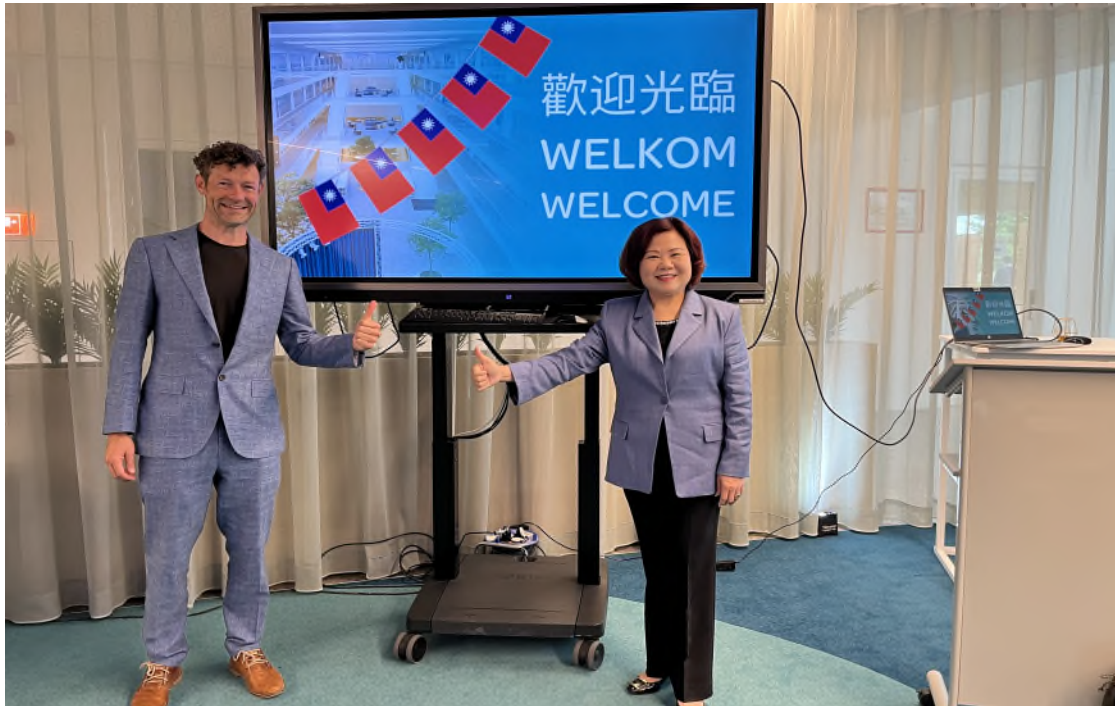
Image 12: Minister Hsu Ming-Chun with Wim Adriaens, Director-General of the VDAB