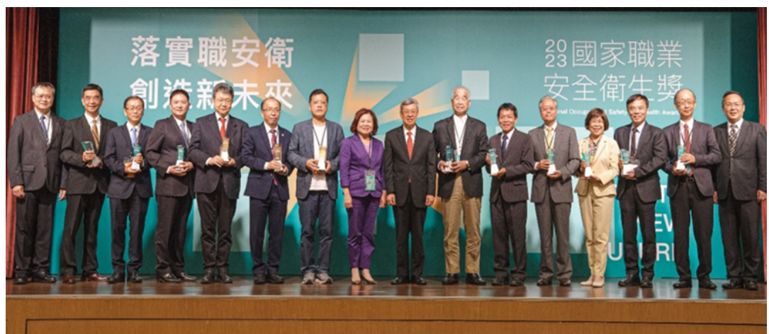
Image 3: Premier Chen Chien-Jen of the Executive Yuan and Minister Hsu Ming-Chun in a group photo with corporate and individual award recipients.