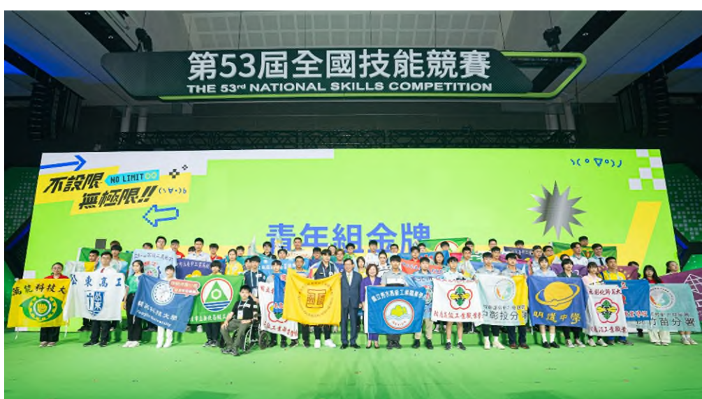
Image 3: Vice Premier Cheng Wen-tsan and Minister of Labor Hsu Ming-chun encouraged the participants of the 53rd National Skills Competition