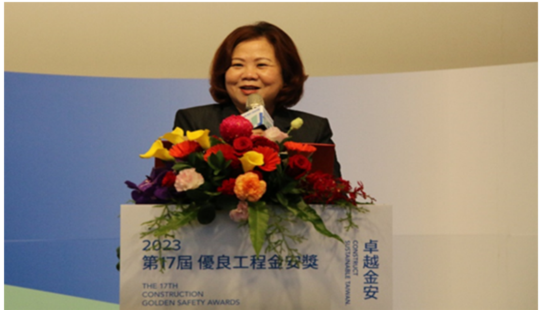
Image 7: Minister Hsu Ming-Chun delivering a speech at the 2023 17th Construction Golden Safety Awards Recognition Ceremony.