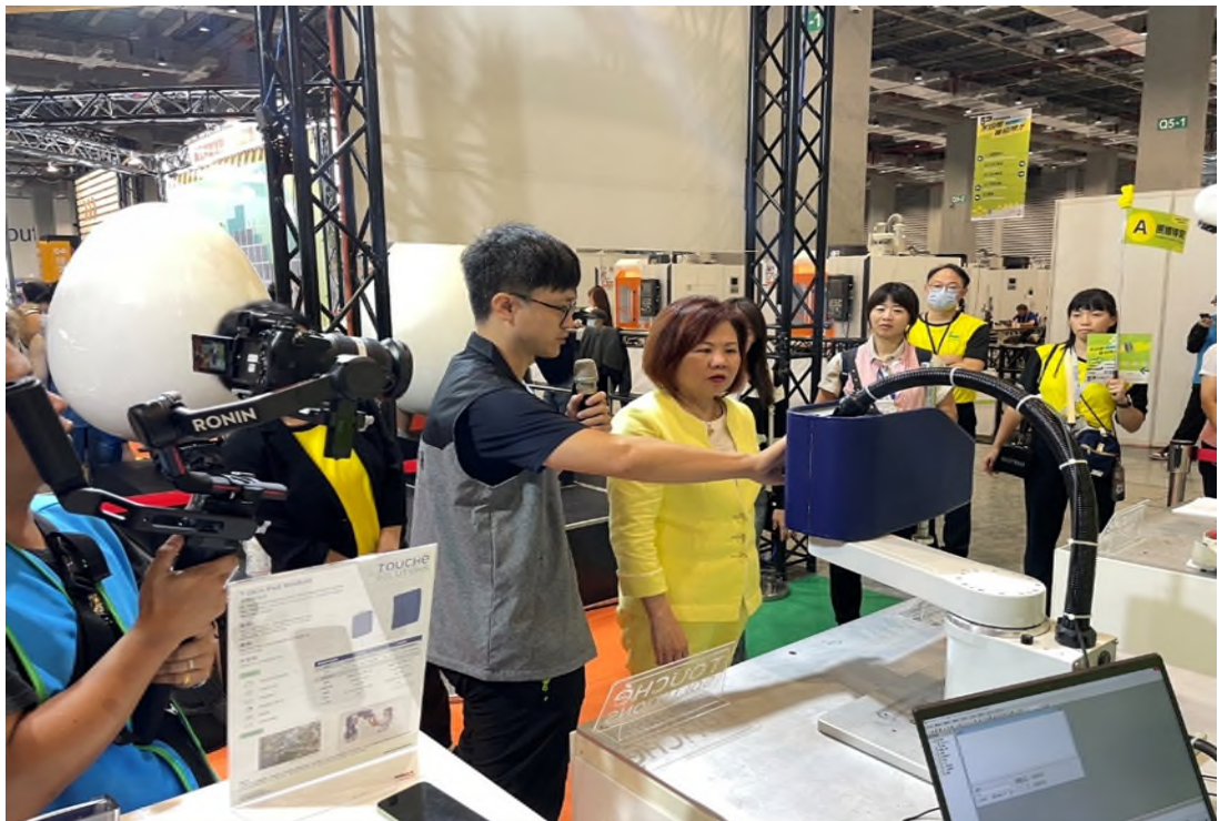
Image 5: Minister of Labor Hsu Ming-chun experiencing the occupational safety protection measures for collaborative robots.