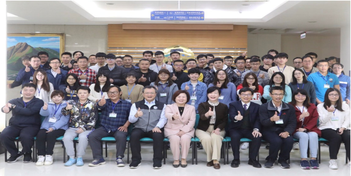
Image 1: Minister of Labor Hsu Ming-chun and Minister Hao Pei-chih of the Civil Service Protection & Training Commission, and trainees in a group photo during the opening ceremony.

13.03-14.04.2023 To demonstrate the determination to defend labor rights and interests, Minister Hsu Ming-chun personally attended the opening ceremony of the “44th Labor Inspector Pre-Service Training” for new members of labor inspection agencies across Taiwan. During the training, she encouraged the inspectors to be courageous in their duties and hoped that they would continuously enhance their professional knowledge, maintain integrity, and work together to fight for the rights and welfare of workers.