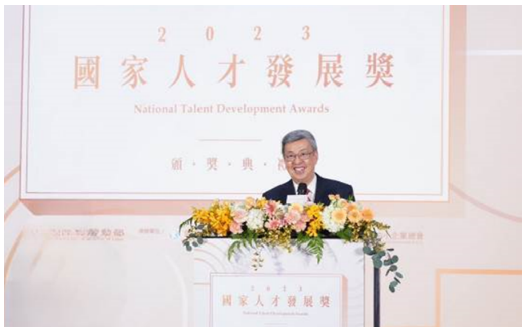
Image 15: Speech by Premier Chen Chien-Jen at the 2023 National Talent Development