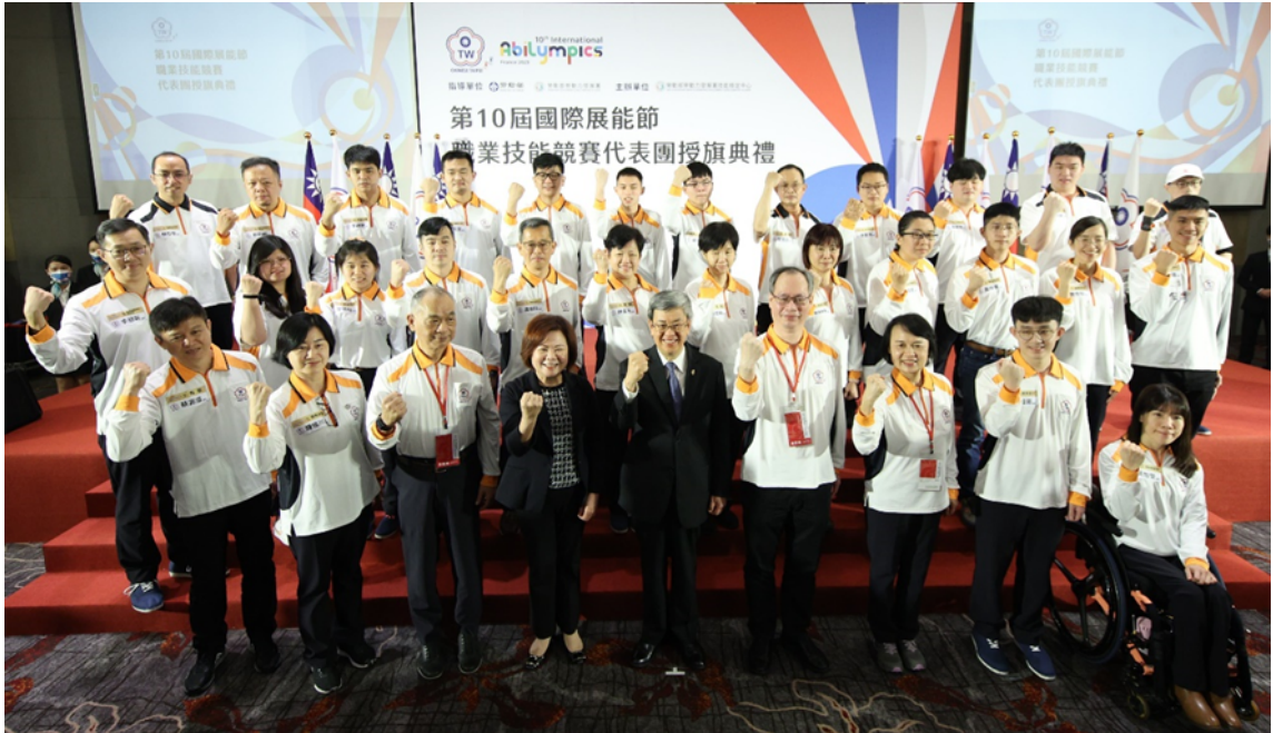
Image 7: President Chen Chien-jen of the Executive Yuan, Minister Hsu Ming-chun pose with Taiwanese contestants for the 10th annual Abilympics 2023.