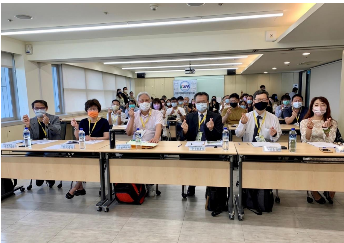
Image 36: Tzou Tzu-Lien, Chief of the Occupational Safety and Health Administration, with panelists during the "A Decade of Occupational Disaster Labor Rehabilitation Policy in Taiwan: Policy Formation and Practice" panel discussion.