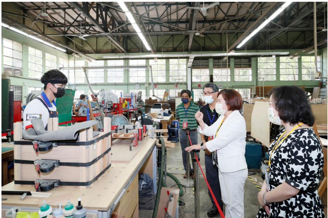
Image 28: Minister Hsu Ming-Chun cheers on the national players in the Furniture & Cabinetmaking skill category of the 46th WorldSkills Competition