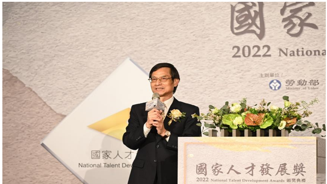
Image 15: Minister Without Portfolio Lin Wan-I delivering an address