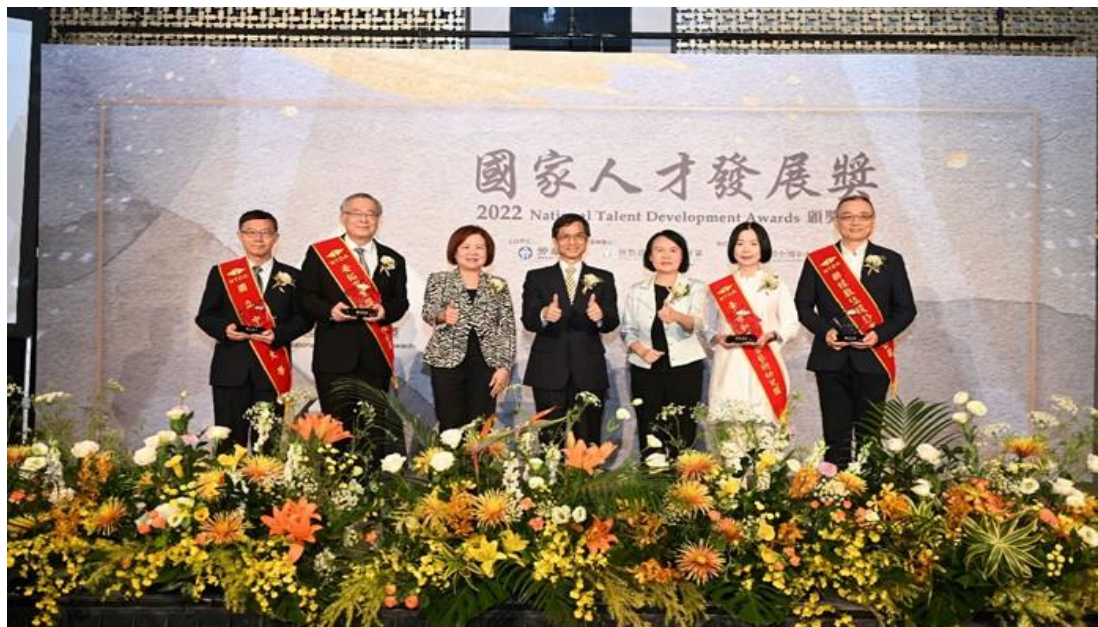
Image 16: Minister Without Portfolio Lin Wan-I delivering an address, Minister Hsu Ming-Chun of the MOL, and Deputy Director-General Chung Chin-Chi posing for a group photo with representatives of awardee units.

25.11.2022 The basic wage was adjusted from NT$25,250 to NT$26,400 effective January 1, 2023, and the “Table of Grades of Insured Salary” and the “Table of Grades of Labor Occupational Accident Insurance Salary” were revised and entered effect simultaneously. The Bureau of Labor Insurance of the MOL has targeted full-time workers whose monthly insured salary is less than NT$26,400 and all insured persons whose monthly insured salary for employment insurance is NT$25,250, assisting them in the direct adjustment of insured salary to NT$26,400, and also notified them of the adjustment by printing a circular on the back of the October 2022 insurance premium payment form to inform all insured units of the direct