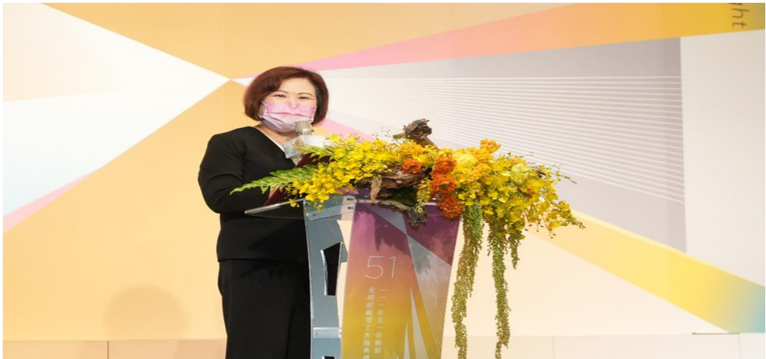
Image 10: Minister Hsu Ming-Chun delivers a speech at the National Model (and Migrant) Worker Award Ceremony.