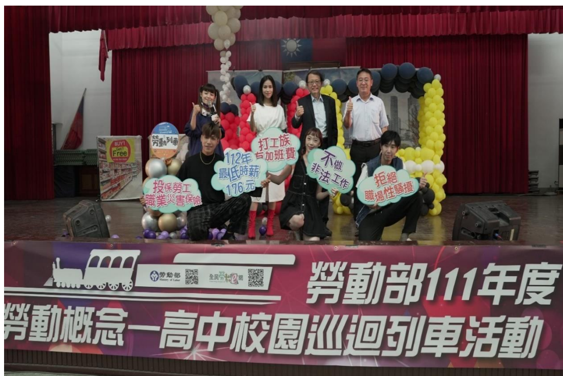
Image 5: Representatives from the MOL, school and the troupe launched the campus tour train together

13-15.10.2022 The Institute of Labor, Occupational Safety and Health (ILOSH) of the Ministry of Labor exhibited a number of patented R&D achievements in the Sustainable Development Pavilion and Patent Competition Area of the