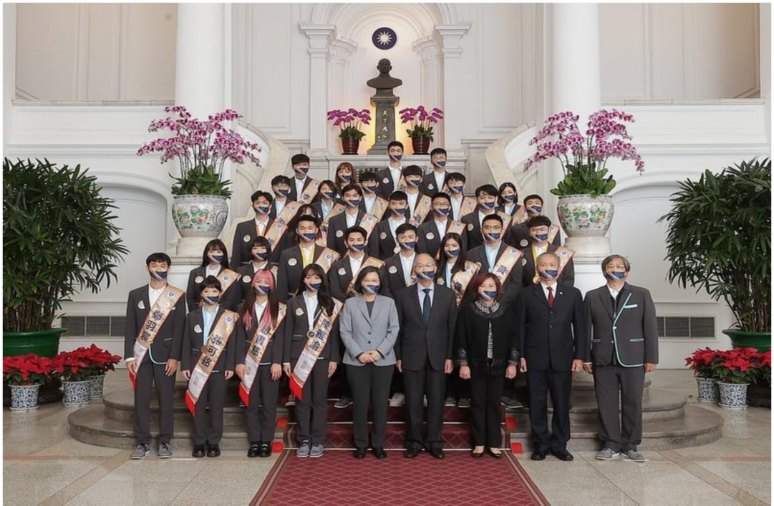
Image 20: President Tsai Ing-Wen meets with the Taiwan delegation of the 2022 WorldSkills Competition

the delegation of WorldSkills Competition 2022 Special Edition was presented with a speech by the President of the Executive Yuan to recognize Taiwan's outstanding talents, judges, instructors, interpreters, and sponsors.