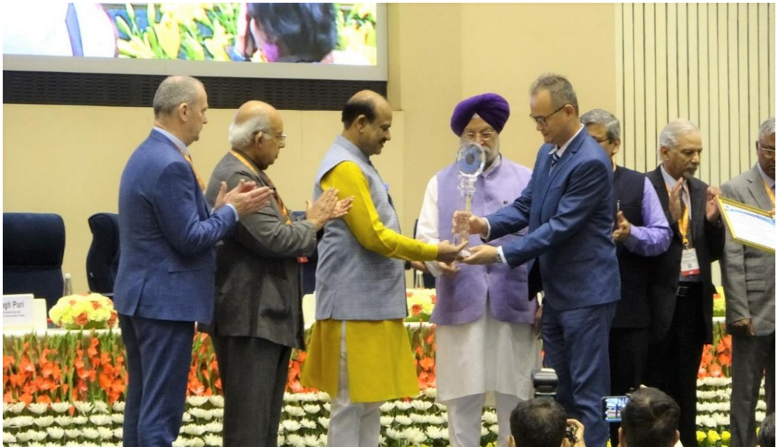
Image 16: The Workforce Development Agency receives two awards during the "IFTDO Global HRD Awards 2022" of the 49th IFTDO World Conference & Exhibition.

19.05.2022 The "Middle-aged and Elderly Employment Promotion Act" and "Promoting the Function Enhancement Program for the Workforce Development Practitioners in Yunlin, Chiayi, and Tainan - Cross-generational Talent Training Program under the 100-Year Life Society", spearheaded by the Workforce Development Agency, received two 2022 Global HRD Awards from the International Federation of Training and Development Organizations (IFTDO). The awards were accepted by the Taipei Economic and Cultural Center in India during the 49th IFTDO World Conference & Exhibition.