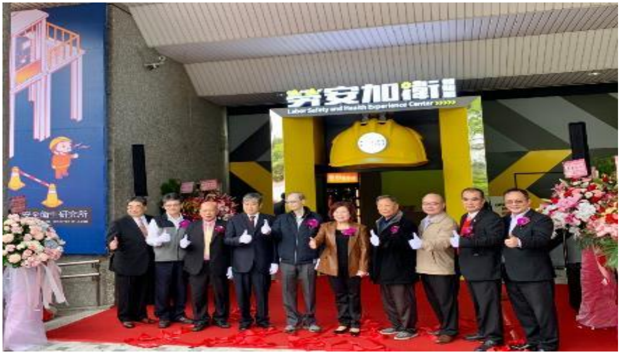
Image 5: Opening ceremony of the Labor Safety and Health Experience Center. Minister of Labor Hsu Ming-Chun and dignitaries attended the ceremony.

30.03.2022 "Attachment 3 of the Labor Insurance Disability Benefit Payment Standards" was amended to remove the age limit of 45 years or less for women to have a hysterectomy and to further differentiate the level of physical damage.