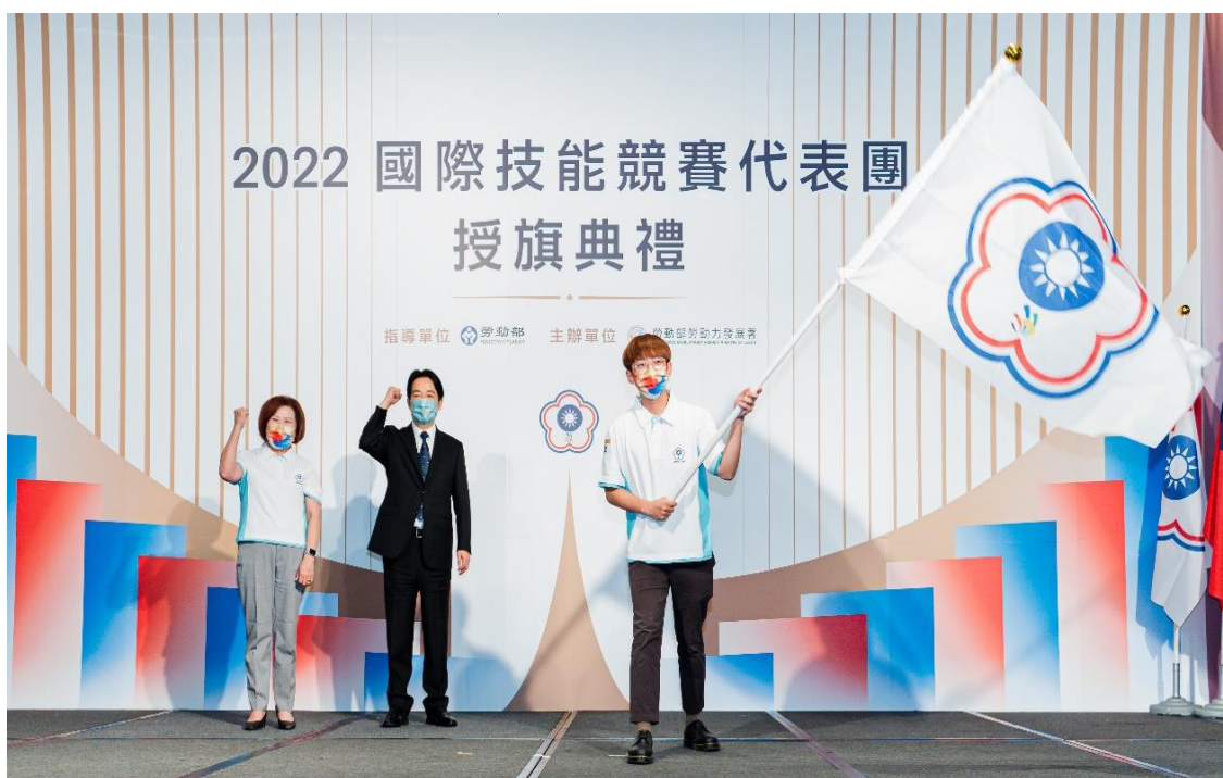
Image 26: Vice President Lai and Minister Hsu Ming-Chun presenting the flag to the national delegation