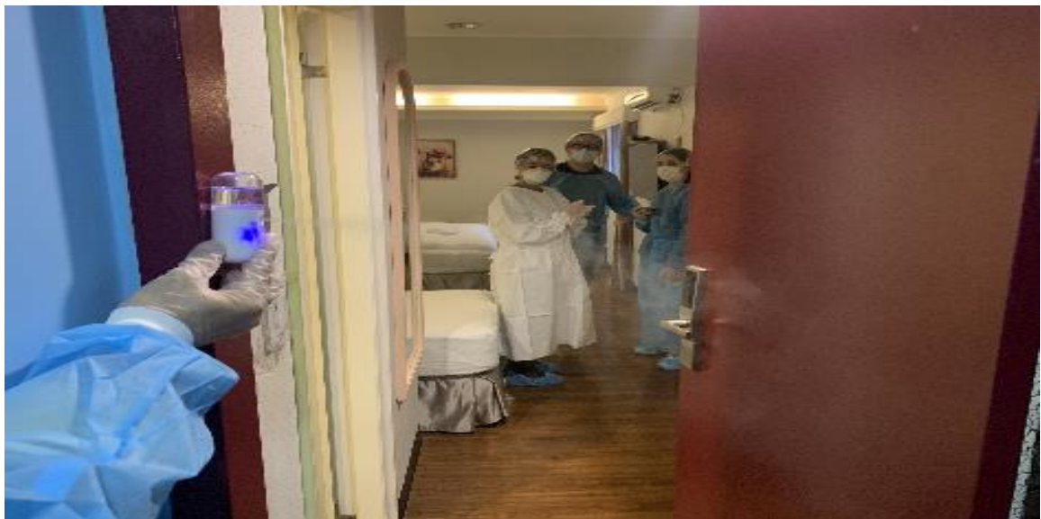
Image 2: ILOSH deployed a simple smoke generation device to facilitate inspection of the ventilation systems of quarantine hotels

25.01.2022 In cooperation with the Central Epidemic Command Center, the Institute of Labor and Occupational Safety and Health (ILOSH) of the MOL, inspected the ventilation system of certain quarantine hotels to prevent cross-infection of staying guests through the ventilation system. During inspections of hotels, it was found that some rooms had poorly designed ventilation and air conditioning systems and partition structures, and the air might circulate between rooms. The results of the inspection were provided to the Central Epidemic Command Center and related units for reference.