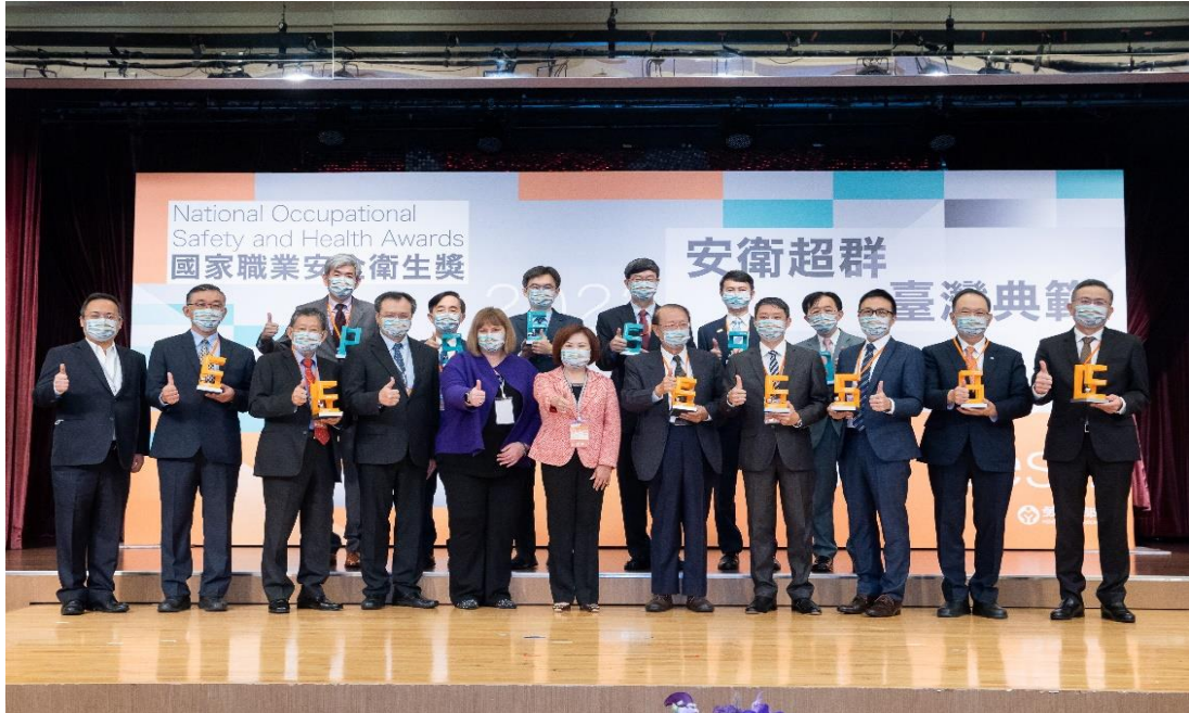
Image 8: Minister Hsu Ming-Chun posing for a photo with awardee organizations and individuals.

20.10.2022 The “2022 National Occupational Safety and Health Award” ceremony was held, with Minister Hsu Ming-Chun presenting the award in person. Among them, five companies received the “Enterprise Benchmark Award”, two companies received the “Special Award for Small and Medium Enterprises”, three companies received the “Special Award for Investment in Traditional Industries”, three companies received the “Special Award for Occupational Labor Health”, and two individuals received the “Individual Contribution Award”.