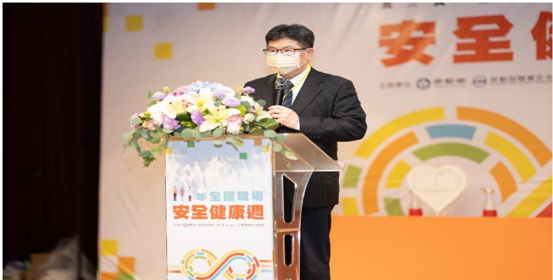
Image 8: Deputy Minister Wang Shang-Chih delivers the opening address to kick-off the "National Occupational Safety and Health Week".

22.04.2022 The "National Occupational Safety and Health Week" kick-off ceremony was held in conjunction with the "2022 International Conference on Occupational Health, Occupational Medicine, and Occupational Health Nursing". Top experts and scholars from the Ministry of Health and Welfare and occupational health and medical fields, as well as international experts from the United States, Australia, New Zealand, and Korea, were invited to join the event by video conference. MOL Deputy Minister Wang Shang-Chih delivered the opening address, encouraging companies to attach importance to the occupational safety, hygiene, and health of workers and actively create a safe working environment so as to jointly raise the standard of occupational safety and health in Taiwan.