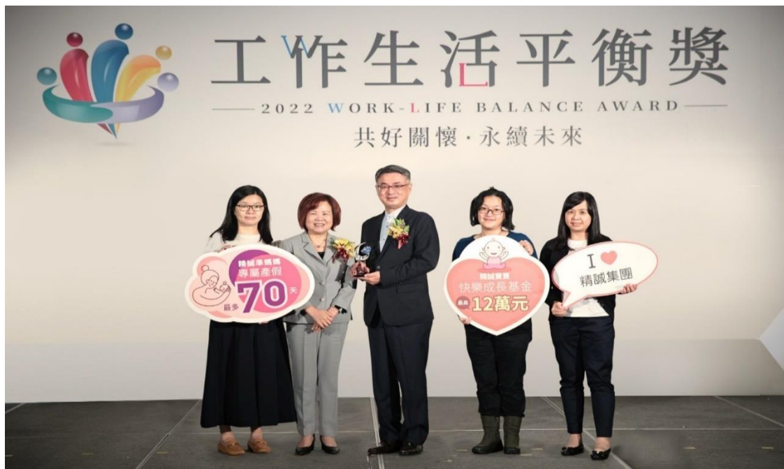
Image 10: Minister Hsu Ming-Chun in a group photo with enterprises that received the “Family-Friendly Award”, recognizing their efforts to create a safe workplace for childcare.