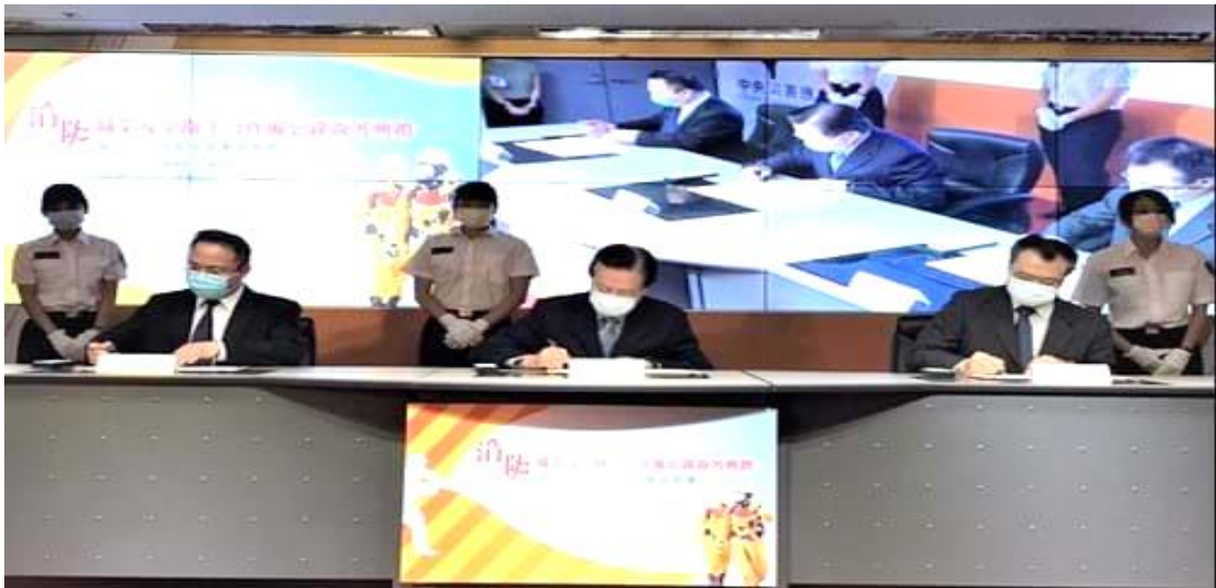
Image 17: OSHA, the ILOSH, and the National Fire Agency of the Ministry of the Interior jointly sign a memorandum of understanding.

24.05.2022 OSHA, the ILOSH, and the National Fire Agency of the Ministry of the Interior jointly signed a memorandum of understanding on occupational safety and health in firefighting to help establish firefighting occupational safety and health management standards and enhance a sound occupational safety and health environment for firefighters.