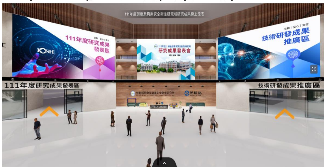
Image 32: 2022 ILOSH Online Presentation of Research Results Event Portal

15.09.2022 The Institute of Labor and Occupational Safety and Health held the 2022 Online Presentation of Research Results. During the epidemic period, the ILOSH leveraged the power of the Internet to deliver the results of labor and occupational safety and health research to workers and occupational safety and health personnel more quickly and easily.