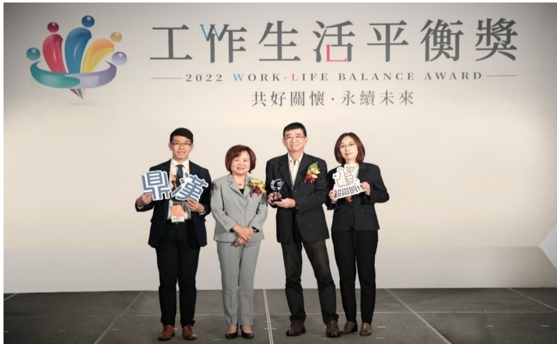
Image 9: Minister Hsu Ming-Chun in group photo with the enterprises that received the “Flexible Work Award”, encouraging enterprises to pay attention to the work-life balance of their employees.

31.10.2022 To recognize and encourage workplace-friendly measures of enterprises, the MOL organized the “2022 Work-Life Balance Award” to recognize outstanding enterprises, and to explore innovative measures in “flexible work”, “family-friendly” and “employee care”, so as to encourage more enterprises to respond to the promotional campaign.