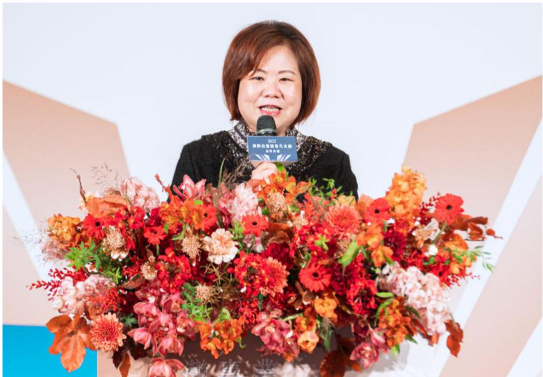
Image 23: Minister Hsu Ming-Chun at the 2022 WorldSkills Competition Award Ceremony