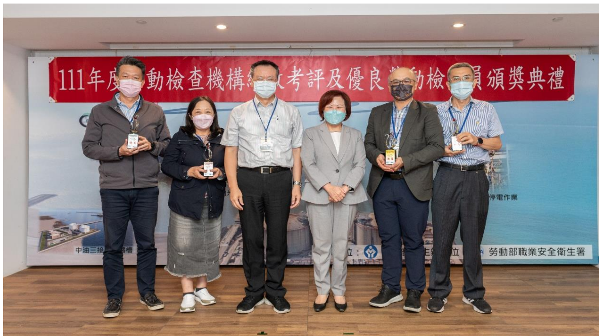
Image 31: During the "2022 Excellent Labor Inspectors Selection", Minister Hsu Ming-Chun presented awards to outstanding inspectors.