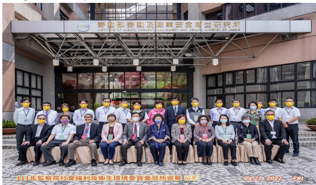
Image 7: Eight members from the Committee on Social Welfare and Environment Hygiene Affairs, Control Yuan, led by Control Yuan President Chen Chu and Convener Hsiao Tzu-Yu, inspect the ILOSH .

22.04.2022 In order to investigate the effectiveness of the implementation and promotion of labor and occupational safety and health research, workplace source safety management mechanism, and disaster prevention measures education, eight members of the Control Yuan, including President Chen Chu, Convener Hsiao Tzu-Yu, and members of the Committee on Social Welfare and Environment Hygiene Affairs visited the Institute of Labor, Occupational Safety and Health (ILOSH), MOL.