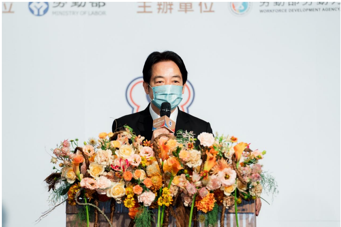
Image27: Vice President Lai attending the 46th WorldSkills Competition Flag Presentation Ceremony