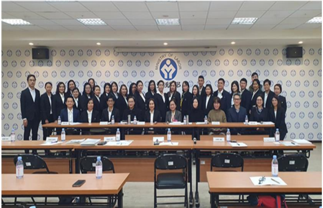
Image 25: A delegation from the Social Security Office of the Ministry of Labor of Thailand visited the Bureau of Labor Insurance of the MOL.

24.12.2022 A press conference was held to launch the One-Stop Incoming Training Workshop for new domestic migrant workers. The opening speech was delivered by Minister Hsu Ming-Chun, who introduced the one-stop service for employers to apply for the five statutory applications and to provide training on the rights of migrant domestic workers.