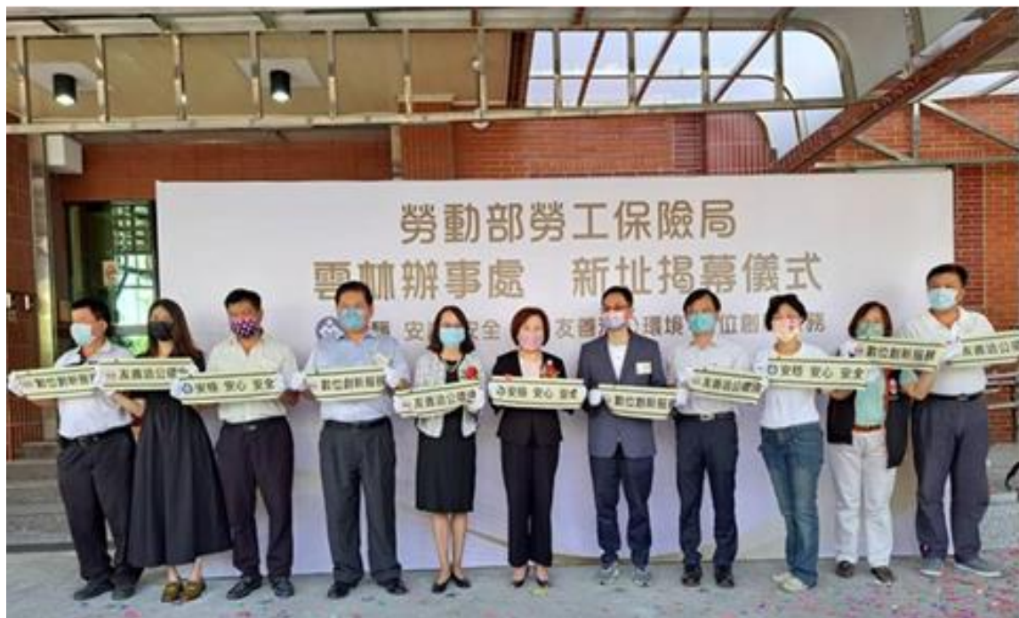
Image 34: The opening ceremony of the Bureau of Labor Insurance's new Yunlin office on September 21, 2022