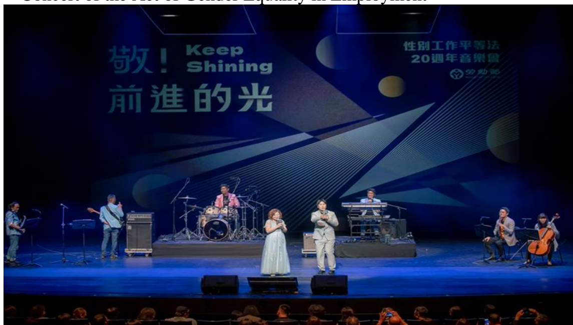
Image29: Minister Hsu Ming-Chun performing for the "Respect! The Light of Progress. The 20th Anniversary Concert of the Act of Gender Equality in Employment".

03.09.2022 Organized the "Respect! The Light of Progress. The 20th Anniversary Concert of the Act of Gender Equality in Employment"