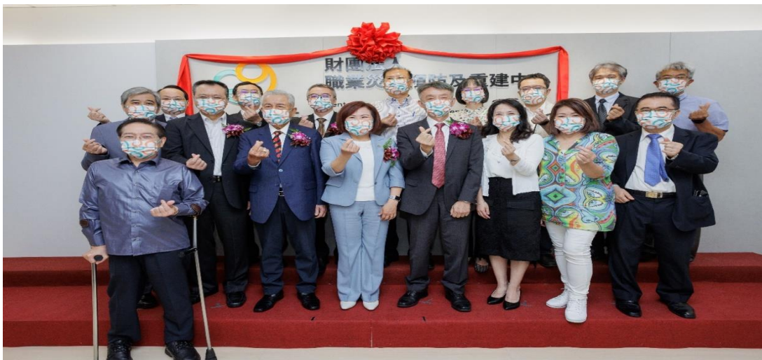
Image13: Minister Hsu Ming-Chun attends the inauguration of the Center for Occupational Accident Prevention and Rehabilitation.

29.04.2022 The Center for Occupational Accident Prevention and Rehabilitation, established with donations from the MOL, was inaugurated. The Center will assume the important role of developing sustainable occupational safety and health, protecting labor health, and promoting the comprehensive services of "prevention", "protection" and "rehabilitation" to safeguard enterprises and workers.