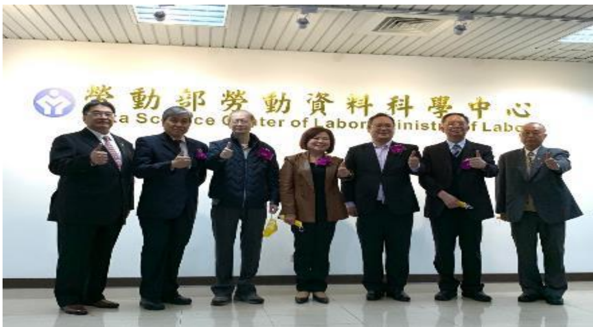
Image 4: Opening ceremony of the Data Science Center of Labor of the MOL

Ministry of Labor inaugurated the "Data Science Center of Labor and the Opening Ceremony of the Labor Safety and Health Experience Center". The Data Science Center of Labor allows for the exchange of information with the Ministry of Health and Welfare, the Council of Agriculture, and other ministries. The Center can immediately grasp the latest trends in labor and workplace safety and health through statistical analysis and provide various units with references for governance and policy-making. The Exhibition Hall of Occupational Safety and Health, established in 2002 and the only one of its kind in the nation, created a new "Labor Safety and Health Experience Center" with "safety and health" as the core in response to the rapid development of digitization and information technology. The Center features a multi-faceted exhibition approach for visitors to experience in a fun and educational way so that the knowledge of proper disaster prevention and labor rights is deeply etched in the minds of visitors.