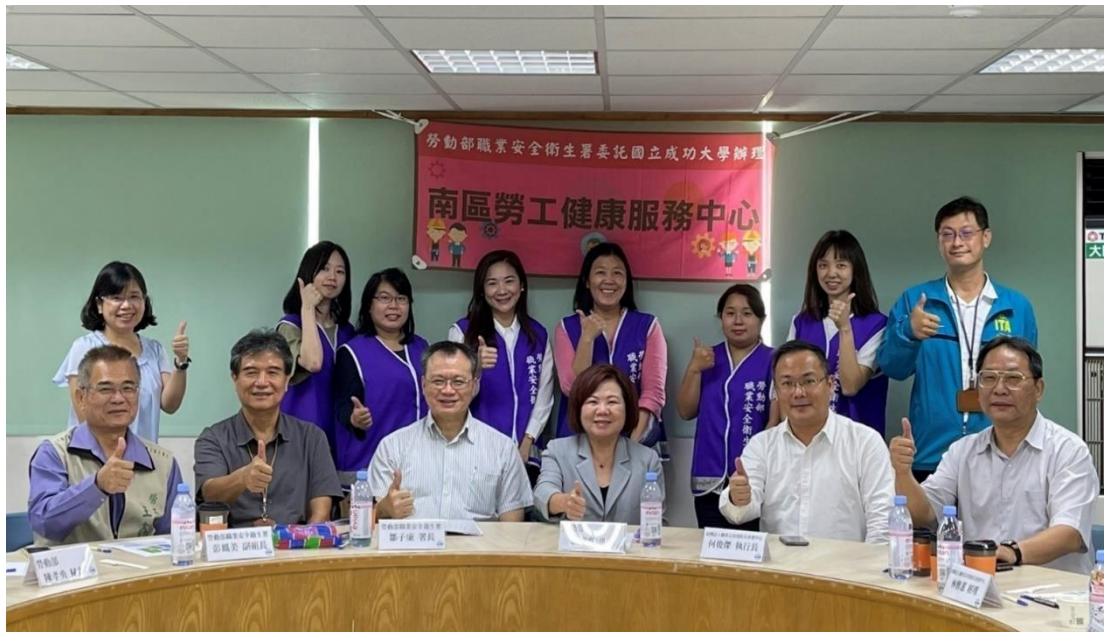
Image 14: Minister Hsu Ming-Chun led a team to inspect the Southern District Labor Health Service Center commissioned by the Occupational Safety and Health Administration.