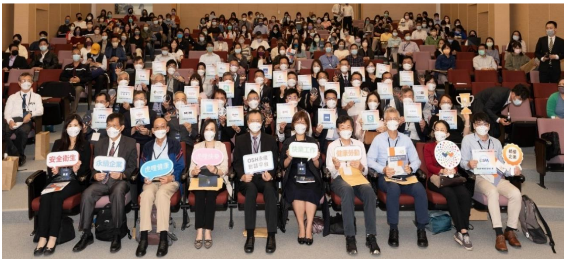
Image 12: The Occupational Safety and Health Administration of the Ministry of Labor, the Health Promotion Administration of the Ministry of Health and Welfare, the Securities and Futures Bureau of the Financial Supervisory Commission, and many other dignitaries and corporate representatives attended the event.