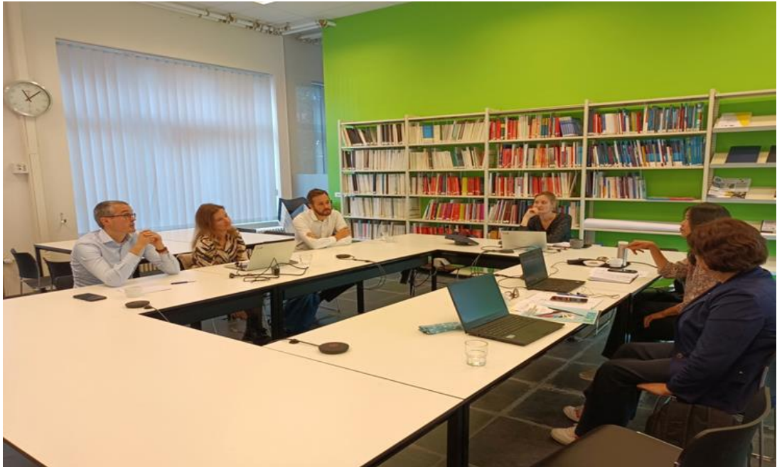
Image 2: Labor Market Research Seminar co-organized by ILOSH and HIVA

participation of researchers from HIVA, researchers from ILOSH, and experts and scholars from related fields to discuss issues focusing on the characteristics of industrial labor mobility and the trend of labor market changes in Taiwan before and after the COVID-19 pandemic.