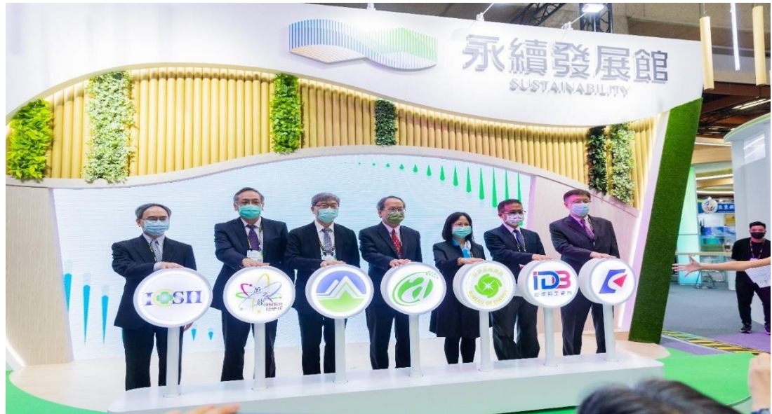
Image 6: Group photo of ILOSH members at the Sustainable Development Pavilion of the Taiwan Innotech Expo

Taiwan Innotech Expo, including “Multifunctional Agricultural Aids”, “Forklift Driving Evaluation Simulation System” and “Volatile Organic Substance Filter Breakage Detection Warning Device”, which not only enable workers to work with peace of mind and improve production efficiency, but also enable enterprises to operate sustainably.