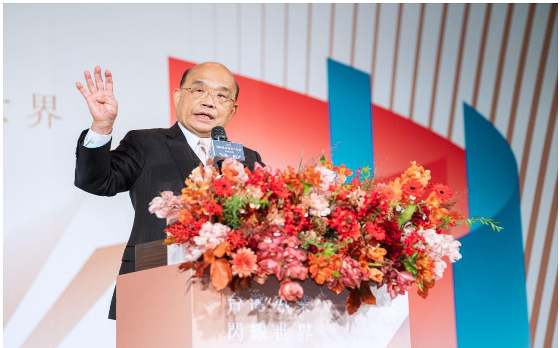
Image 21: President Su Tseng-Chang of the Executive Yuan delivered a speech at the 2022 WorldSkills Competition Award Ceremony