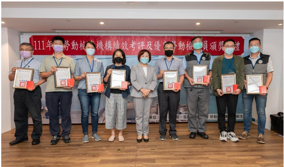
Image 30: During the "2022 Labor Inspection Agency Performance Evaluation", Minister Hsu Ming-Chun presented awards to the top-performing units