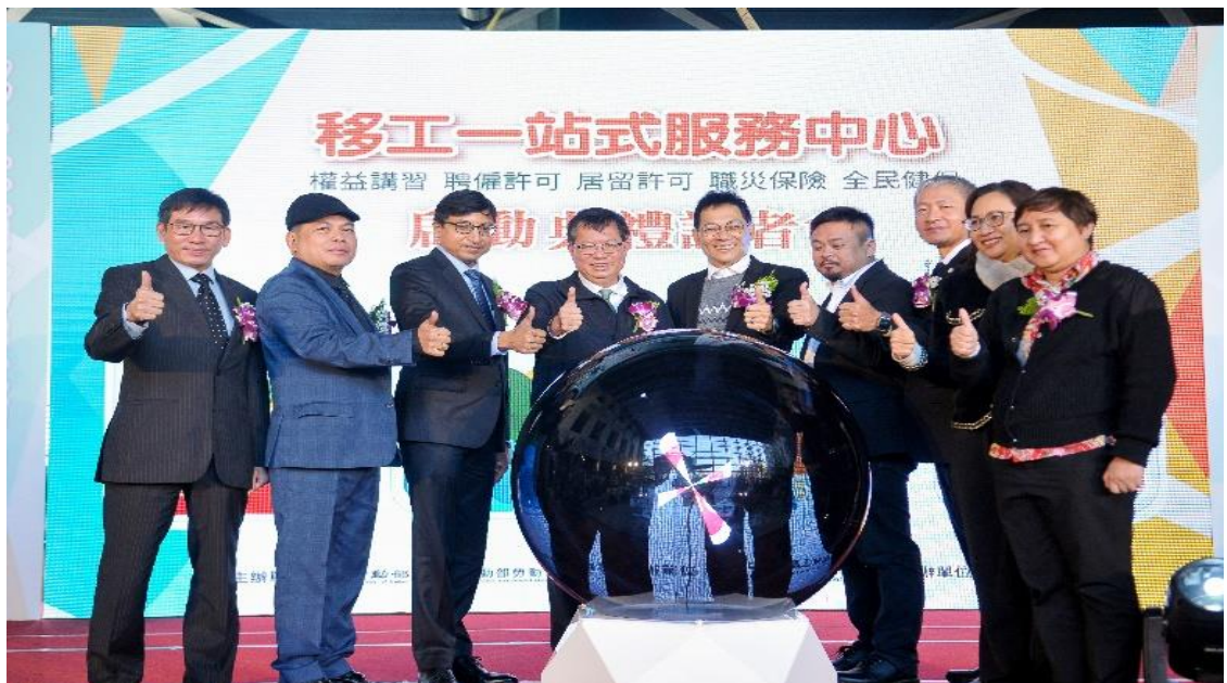
Image 26: Press conference on the launch of the One-Stop Training Workshop for Incoming Migrant

24.12.2022 A press conference was held to launch the One-Stop Incoming Training Workshop for new domestic migrant workers. The opening speech was delivered by Minister Hsu Ming-Chun, who introduced the one-stop service for employers to apply for the five statutory applications and to provide training on the rights of migrant domestic workers.