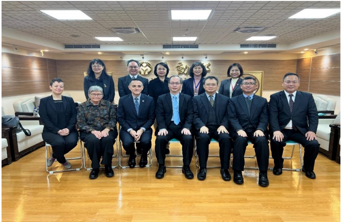
Image 24: The delegation of the U.S. Federal Labor Officials visited the MOL

affiliated agencies (organizations), the Ministry of Foreign Affairs, and the American Institute in Taiwan during the visit. The Ministry also organized the “Taiwan-U.S. Labor Affairs Symposium”, inviting experts and scholars in related fields to discuss labor relations and dispute handling system, as well as the current situation and future outlook of occupational safety and health, all of which are conducive to continued collaboration on labor affairs between Taiwan and the U.S., and to deepen the cooperative relationship and expand the exchange opportunities.