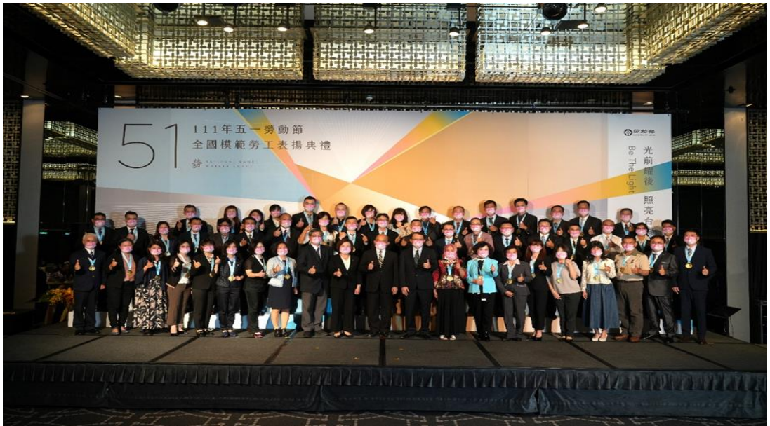
Image9: Premier Su Tseng-Chang attends the National Model (and Migrant) Worker Award Ceremony