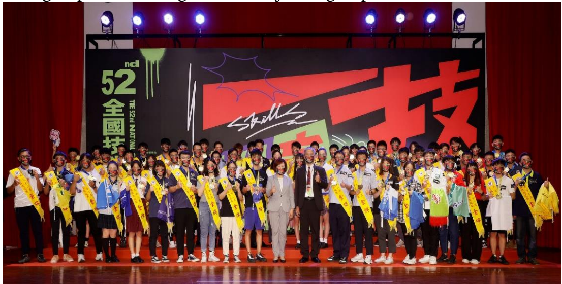
Image22: Minister Hsu Ming-Chun and WDA Director-General Tsai Meng-Liang posing with the gold medalists of the youth group.