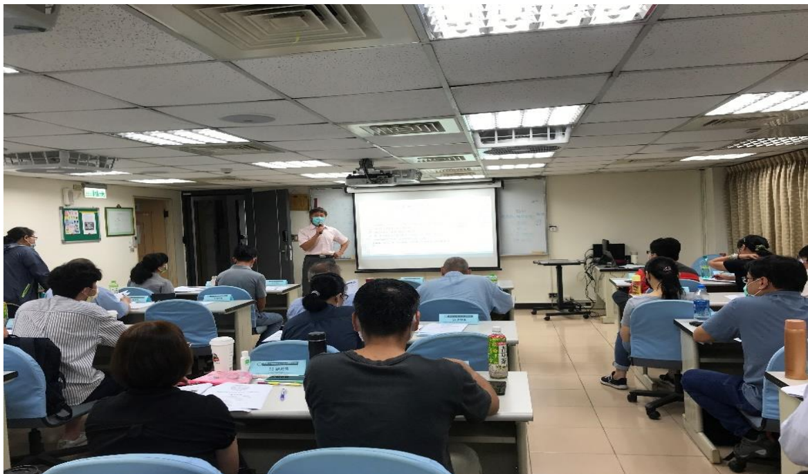
Image 20: Functional course of "Training on the Necessary Competencies of the Formwork Support and Evaluation System"

26.07.2022 The Institute of Labor and Occupational Safety and Health of the MOL organized the "Pingtung Labor Youth and Employment Peace of Mind - Occupational Safety and Health Special Exhibition" at the Labor and Youth Development Department of the Pingtung County Government. The exhibition enables workers in Pingtung County to increase awareness of occupational safety and health hazards and prevention in their local area.