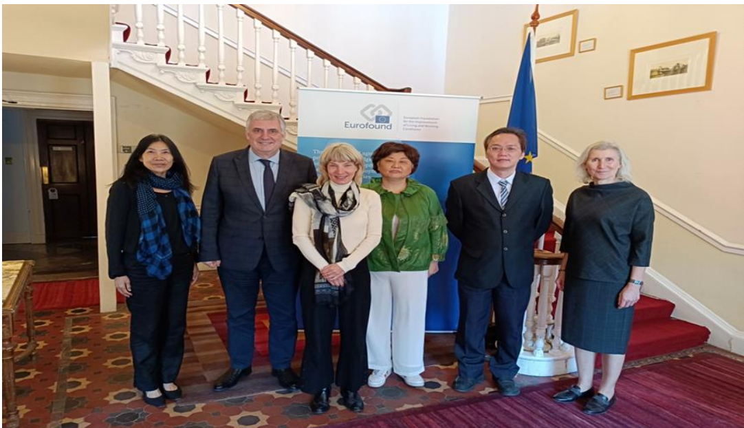
Image 3: Members of the ILOSH delegation with Eurofound Executive Director Ivailo Kalfin (second from left) and his team.

10.10.2022 The Institute of Labor, Occupational Safety and Health (ILOSH) visited the European Foundation for the Improvement of Quality of Life and Labor Conditions (Eurofound) in Ireland to discuss the feasibility of participating in the European Working Conditions Survey (EWCS). Eurofound subsequently agreed for ILOSH to participate in the international EWCS program on a regular basis for five years, with the ILOSH hoping to effectively enhance the visibility and exposure of the MOL internationally.