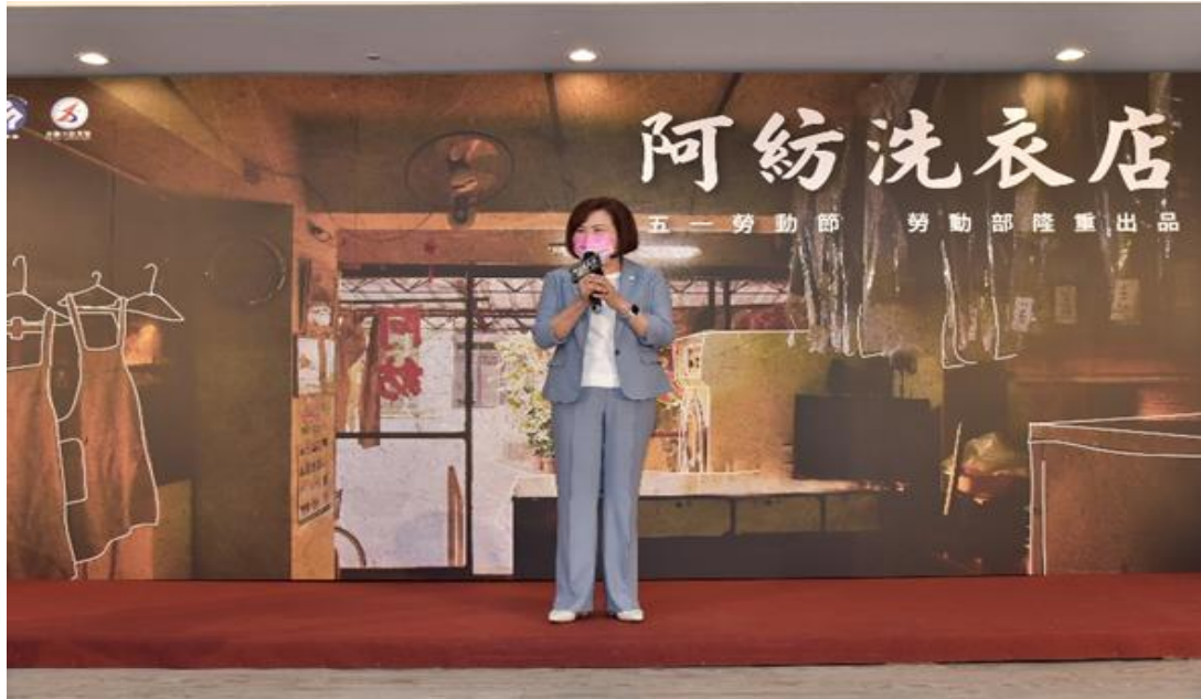
Image12: Minister Hsu Ming-Chun delivers a speech at the press conference for the premiere of the Labor Day film "Ah-Fang Laundromat".

29.04.2022 On the eve of Labor Day, MOL Minister Hsu Ming-Chun presided over a press conference to mark the premiere of the Labor Day film "Ah-Fang Laundromat". Also in attendance were the film's lead singer Henry Hsu, the presidents of national-level trade unions, and the president of the National Federation of Washing and Dyeing Industry Unions of the Republic of China. Combining literature, music and visuals, the featured film is a tribute to the hard work of our fellow workers.