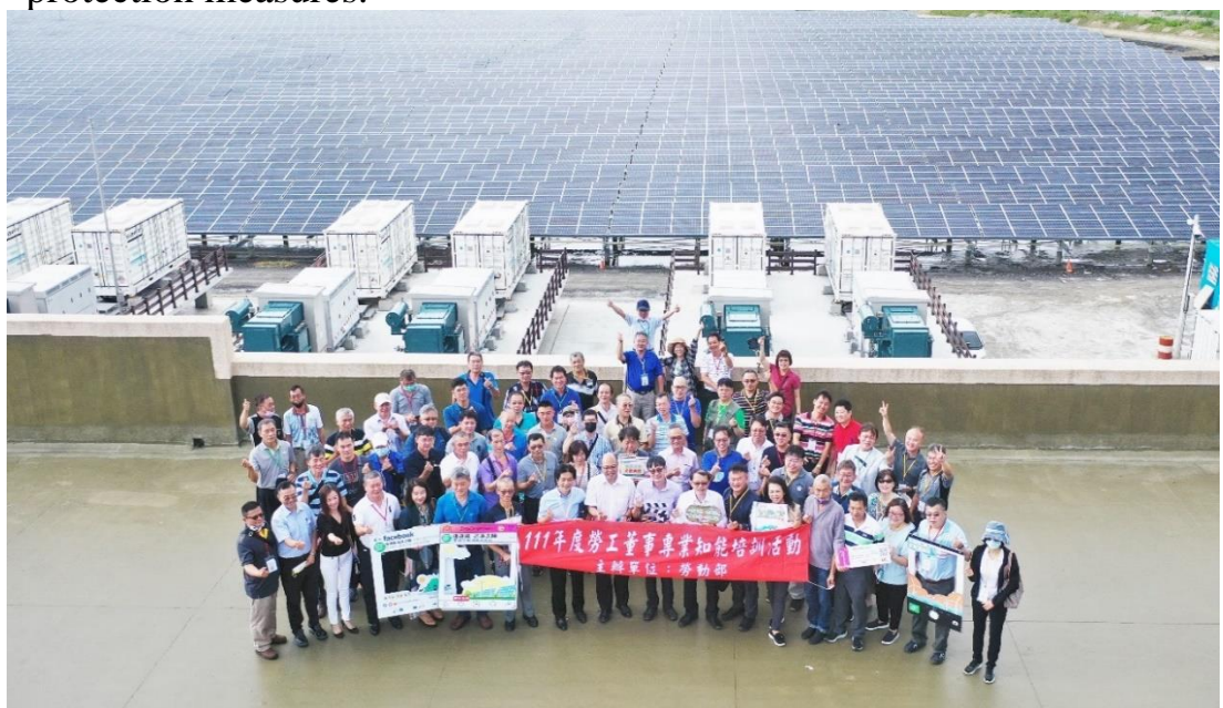
Image 24: Participants in the “Labor Director Professional Competency Training Program” visited Yantian Photovoltaic Station.