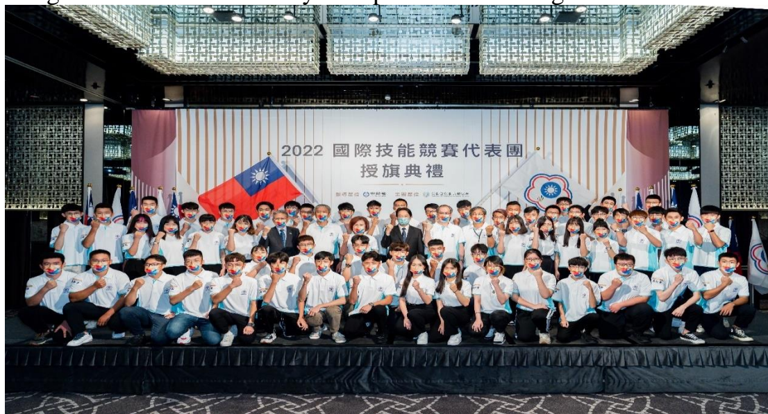
Image 25: Vice President Lai and Minister Hsu Ming-Chun posing with the national players of the 46th WorldSkills Competition

01.09.2022 Vice President Lai Ching-Te attended the 46th WorldSkills Competition Flag Presentation Ceremony to express his encouragement.