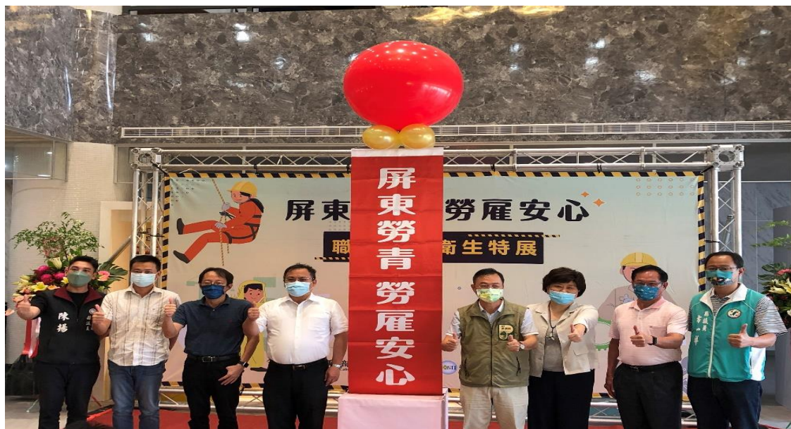
Image21: Group photo at the opening of the "Pingtung Labor Youth and Employment Peace of Mind - Occupational Safety and Health Special Exhibition"

26.07.2022 The Institute of Labor and Occupational Safety and Health of the MOL organized the "Pingtung Labor Youth and Employment Peace of Mind - Occupational Safety and Health Special Exhibition" at the Labor and Youth Development Department of the Pingtung County Government. The exhibition enables workers in Pingtung County to increase awareness of occupational safety and health hazards and prevention in their local area.