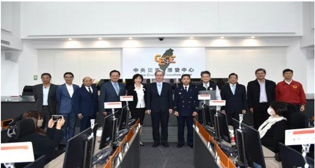
Image 17: Practical Sharing and Observation Meeting on the Promotion Model of Occupational Safety and Health Management System for Fire Agencies

01.12.2022 The Institute of Labor, Occupational Safety and Health (ILOSH) of the Ministry of Labor and the National Fire Agency of the Ministry of the Interior jointly held the “Practical Sharing and Observation Meeting on the Promotion Model of Occupational Safety and Health Management System for Fire Agencies”, the first occupational safety and health management system for fire agencies, to safeguard the occupational safety and health of firefighting personnel.