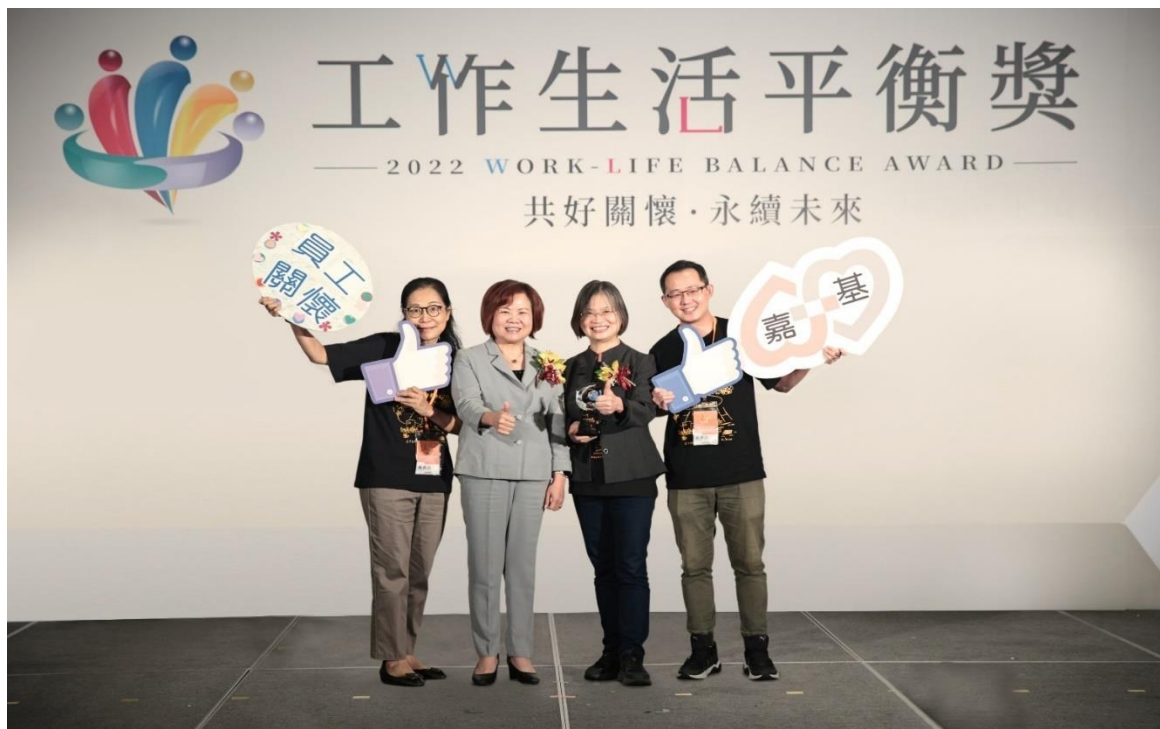
Image 11: Minister Hsu Ming-Chun in a group photo with enterprises that received the “Employee Care Award”, commending the awardees for taking care of the physical and mental health of their employees.

04.11.2022 Formulated “Key Points for Selection of Labor Education Professionals”, to establish a system for the selection of labor education professionals and to foster the promotion of labor education.