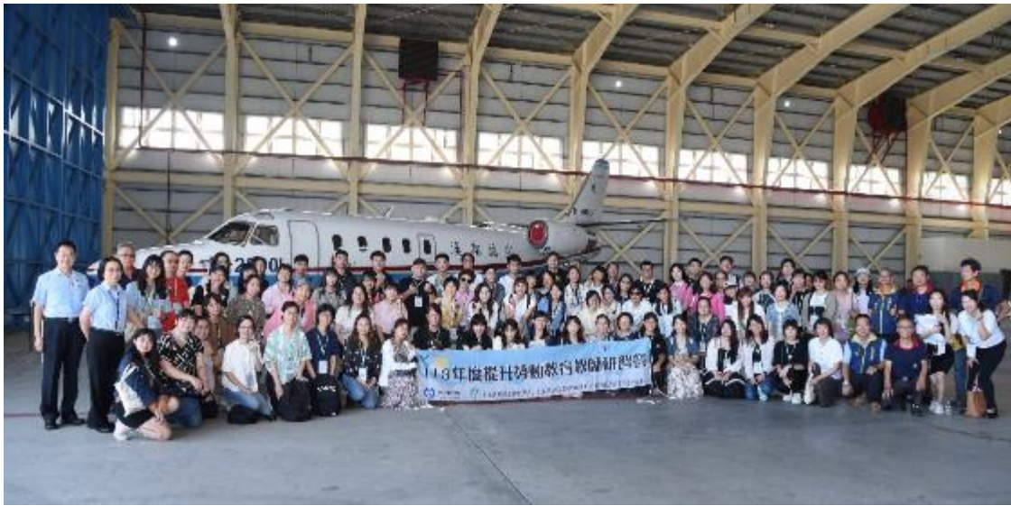
Figure 1: High school teachers engage in workplace and union visits to observe contemporary labor practices and union operations.