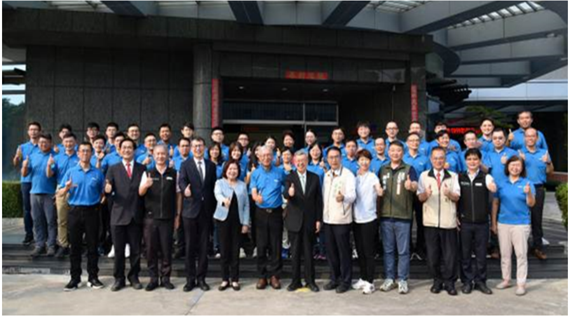
Image 2: Former Premier Chen Chien-jen (center, front row) in a group photo with Lucidity Enterprise employees.