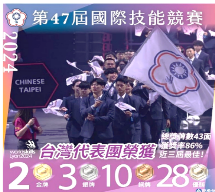
Figure 6: Taiwan won 2 gold medals, 3 silver medals, 10 bronze medals, and 28 medallions for excellence at the 47th WorldSkills Lyon 2024.

Taiwan's 58-member national team participated in the “47th WorldSkills Lyon 2024” in France, competing in 50 skill categories. The team's exceptional performance yielded 2 gold medals, 3 silver medals, 10 bronze medals, and 28 medallions for excellence, placing Taiwan 4th among 69 participating countries and showcasing the country's remarkable vocational and technical skills on the international stage.