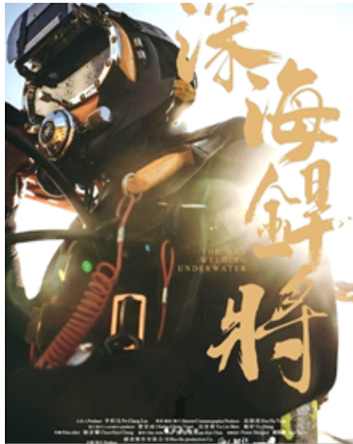
Image 11: ILOSH's documentary "The Man Welding Underwater" receiving second place in the feature-length category at the 2024 Taipei Labor Film Festival.