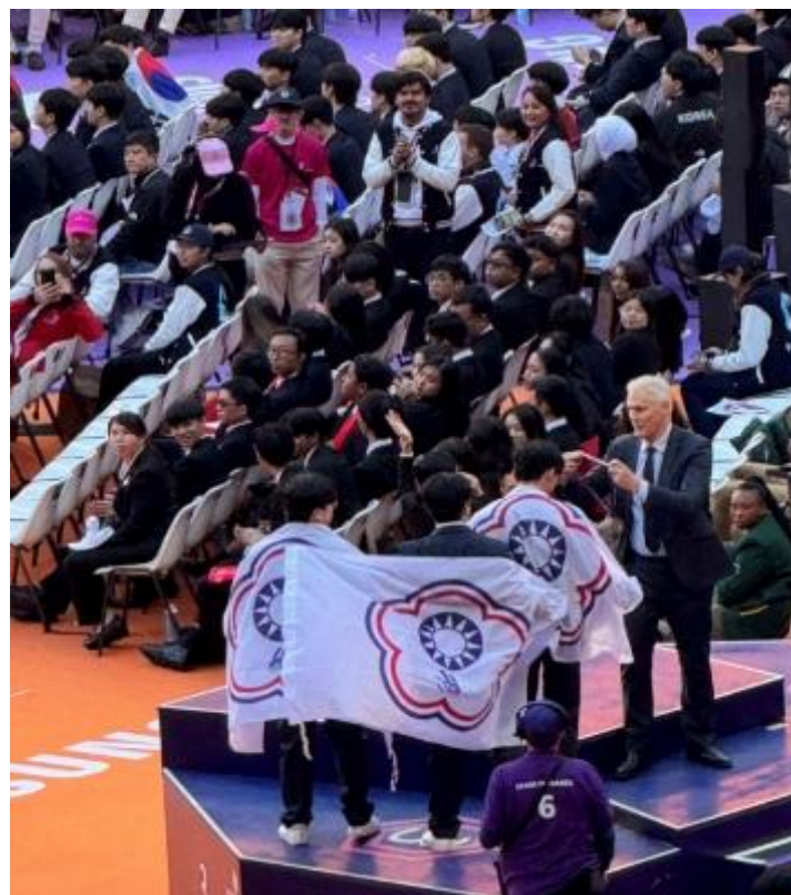
Figure 8: Taiwanese national team members in the group creation skill category take the stage to receive their awards at the 47th WorldSkills Lyon 2024.