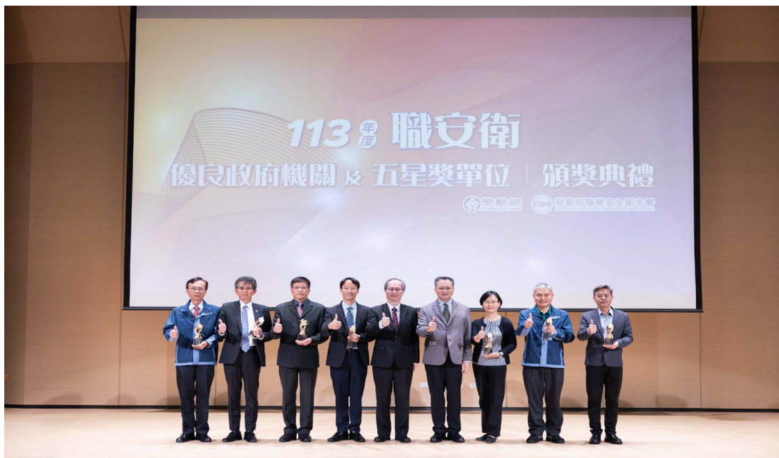
Image 16: Group photo of the recipients of the Five-Star Award for Occupational Safety and Health Excellence in 2024.

The Ministry of Labor held the "2024 Occupational Safety and Health Excellence Award Ceremony for Government Agencies and Five-Star Units", recognizing outstanding local governments and enterprises for their efforts in promoting workplace safety and health. The award winners were commended for their achievements and encouraged to continue enhancing their practices to create a safer working environment.