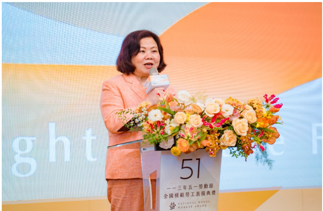
Image 7: Former Minister of Labor Hsu Ming-chun delivered a speech at the "2024 Labor Day National Model Worker Award Ceremony."