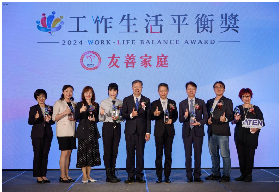
Image 10: Former Deputy Minister Hsu Chuan-Sheng with companies honored with the “Employee Care Award,” acknowledging their commitment to employees’ physical and mental well-being.