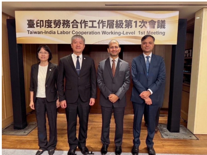
Image 12: Group photo of the 1st Taiwan-India Labor Cooperation Working-Level Meeting.

The inaugural "Taiwan-India Labor Cooperation Working-Level Meeting" was held at the Grand Hyatt Taipei. Representatives from both sides reached multiple agreements regarding the introduction of Indian migrant workers. During the initial phase, the traditional manufacturing industry will be prioritized, with an initial batch of 1,000 workers to be introduced. Of these, 5% will be recruited through a direct hiring system, and a dedicated direct hiring window will be established between Taiwan and India. Moving forward, both parties will hold regular working-level meetings to discuss and refine implementation details.