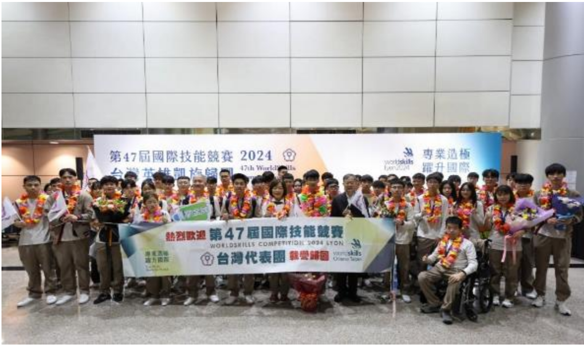
Figure 7: A group photo of Minister of Labor Pei-shan Ho with the 47th WorldSkills Lyon 2024 national team members from Taiwan.