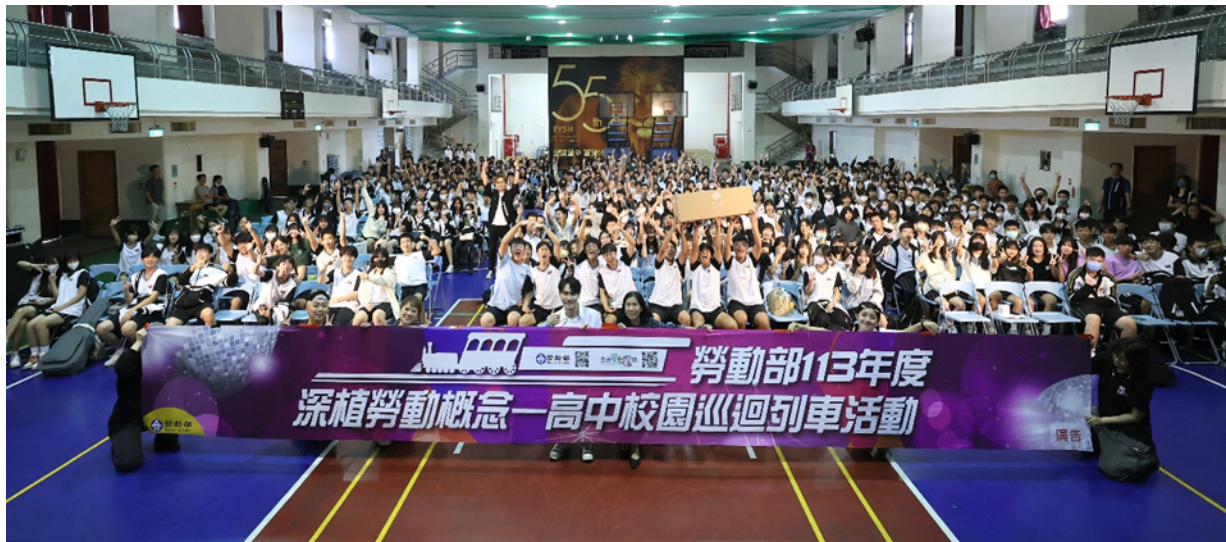
Image 2: Group photo of teachers and students participating in the Labor Education Campus Tour event at Fengyuan Senior High School.