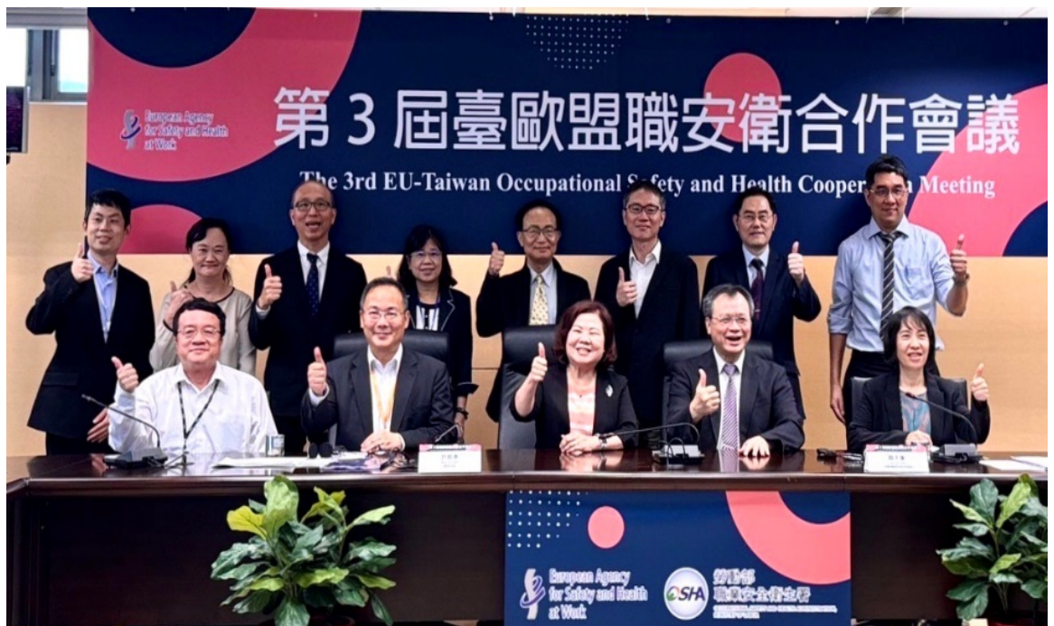
Image 5: Former Minister Hsu Ming-chun led members of Taiwan's OSHA, ILOSH, and COAPRE to attend the EU-Taiwan Occupational Safety and Health Cooperation Meeting.