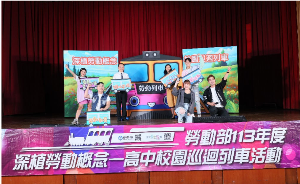
Image 1: Launch of the 2024 Labor Education Campus Tour at Fengyuan Senior High School, Taichung City.

The "2024 Embedding Labor Concepts - Labor Education Campus Tour" was launched at Fengyuan Senior High School in Taichung City with an opening ceremony and a stage play performance. Through theatrical storytelling, the event aimed to promote proper labor concepts among young students, fostering a deeper understanding of labor rights and responsibilities from an early age.