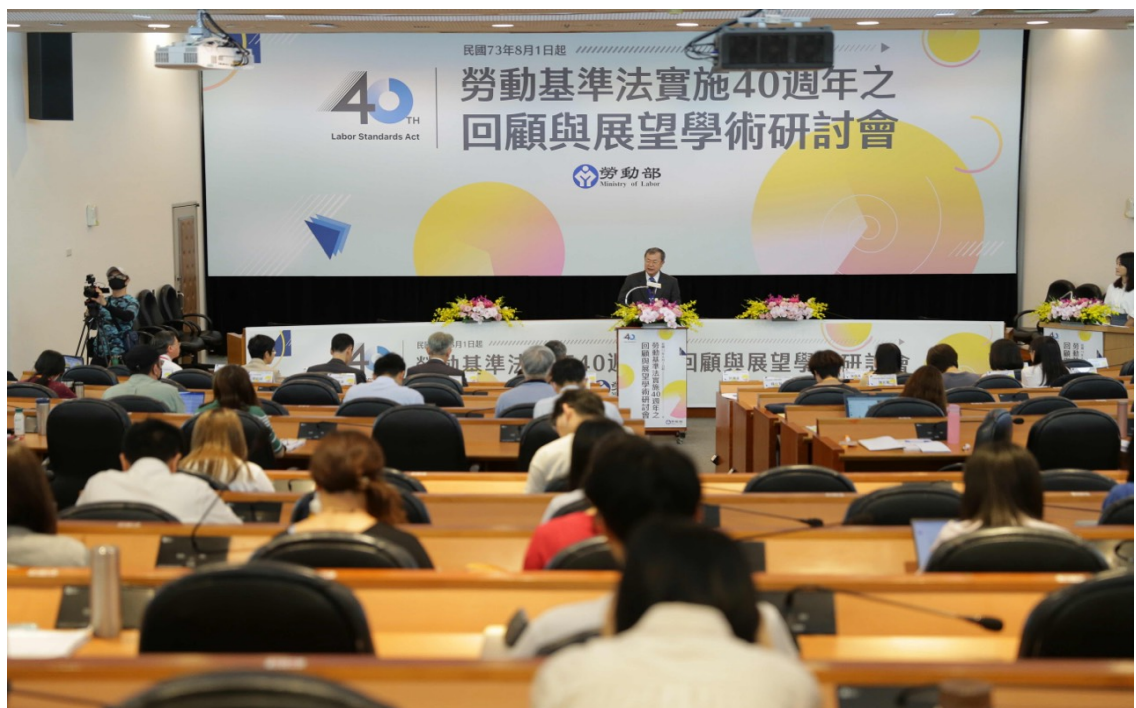
Image 11: Deputy Minister Hsu Chuan-sheng delivering the opening speech at the symposium.

The "Review and Outlook Academic Symposium on the 40th Anniversary of the Implementation of the Labor Standards Act" was held both in physical and virtual format. The symposium focused on flexible working hours, legal holidays, dismissal protection regulations, and international labor pension systems.