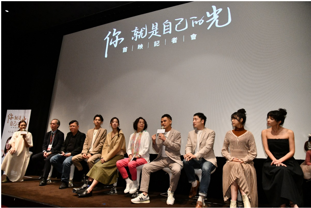
Image 15: Vice Minister Chen Ming-Jen watching the screening with the cast, calling on the public to recognize the importance of workplace equality.