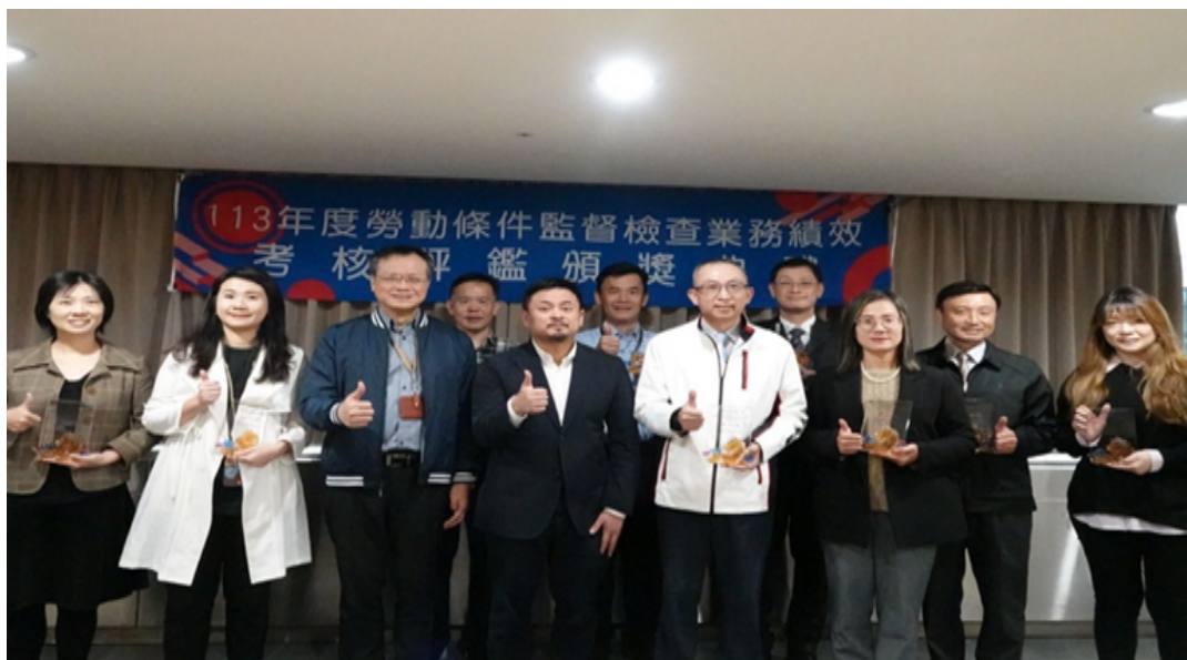
Image 21: Minister of Labor Hung Sun-Han and Director-General Tzou Tzu-Lien of the Occupational Safety and Health Administration in group photo with award-winning units.

The "2024 Labor Conditions Supervision and Inspection Performance Evaluation Awards Ceremony" was held, with Minister of Labor Hung Sun-Han personally presenting the awards. The event recognized outstanding labor administration agencies for their exemplary performance in labor conditions supervision and inspection. The awards aim to encourage agencies to enhance enforcement of labor regulations, ensuring a better and safer working environment for employees.