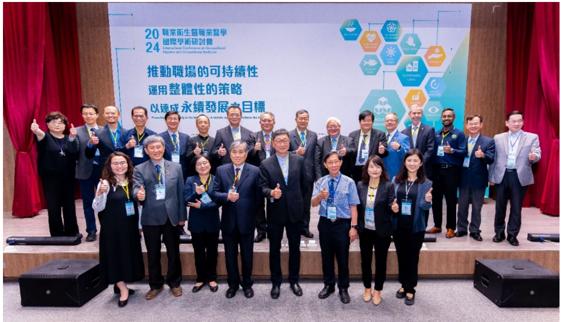
Image 3: Deputy Minister of Labor Hsu Chuan-sheng (center, back row) in a group photo with participants of the international conference.