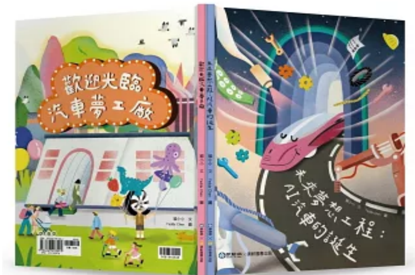
Figure 2: The picture book employs a creative "dual cover, dual story" format, allowing readers to experience different perspectives on corporate operations.