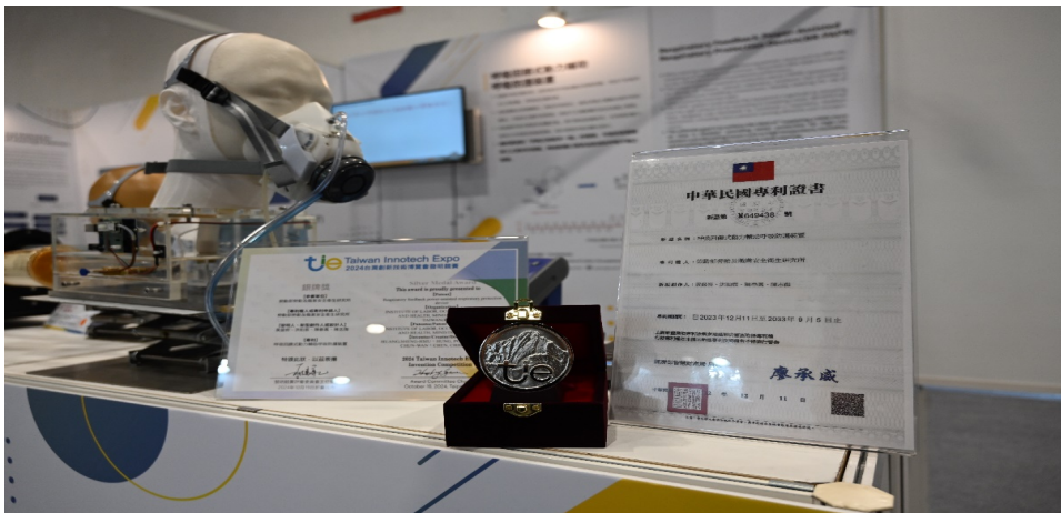
Image 5: The BR-PAPR won the Silver Medal at the 2024 Taiwan Innotech Expo.

The Institute of Labor, Occupational Safety and Health (ILOSH), Taiwan, participated in the 2024 Taiwan Innotech Expo, showcasing a variety of technological innovations related to occupational safety and health. Featured developments included the "Industrial Smart Safety Helmet", "Smart Image Recognition Crane Safety Control and Monitoring System", "Chemical Safety Master – Multilingual Interactive Experience Platform", "Multi-Function Cooling Vest", "Intelligent Workplace Detection Module for the Construction Industry", and "Self-Assessment Noise Protection Device with Sensor Technology". The three-day in-person exhibition attracted nearly 50,000 visitors. Additionally, the "Breath Responsive Powered Air-Purifying Respirators (BR-PAPR)" patent competed in the Invention Competition, winning the Silver Medal among 600 domestic and international entries.