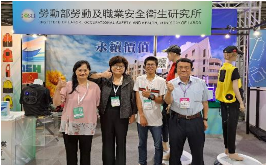
Figure 9: Chief Secretary Yu-wen Chen of the Institute of Labor, Occupational Safety and Health, MOL, and colleagues at the 2024 Taiwan Smart Agriweek, attending the Multipurpose Ice-Sensation Cooling Vest display.