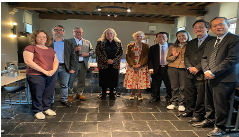
Image 4: Group photo after the 3rd Taiwan-Belgium Labor Policy Collaboration Conference.