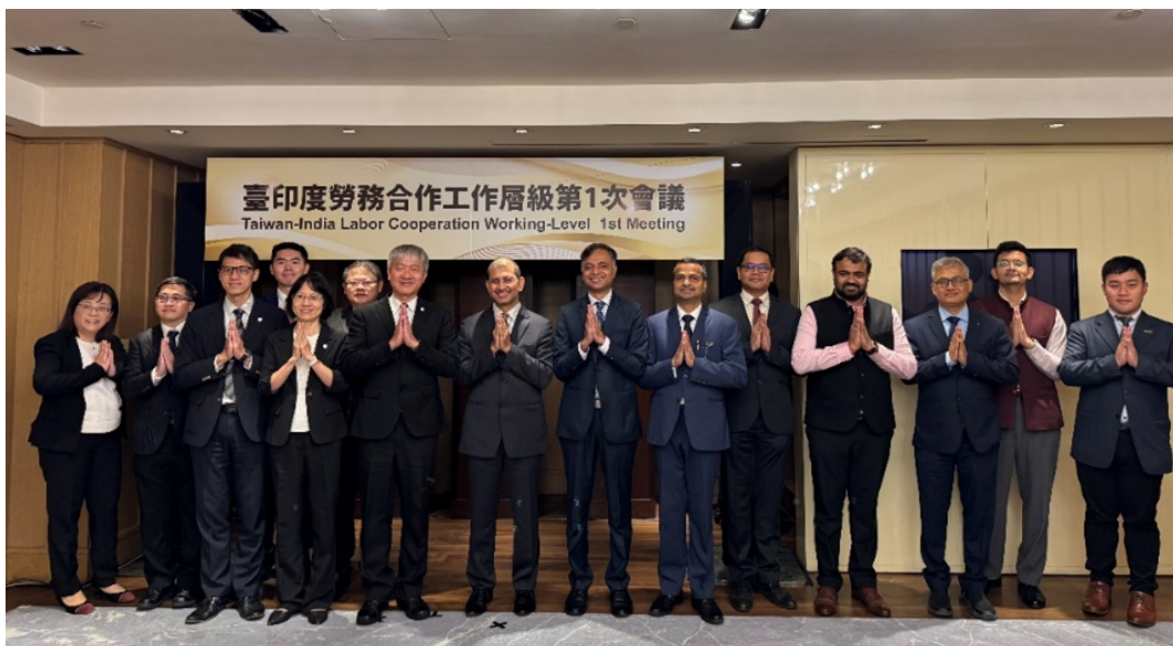
Image 14: Taiwan and India delegation representatives at the 1st Taiwan-India Labor Cooperation Working-Level Meeting.