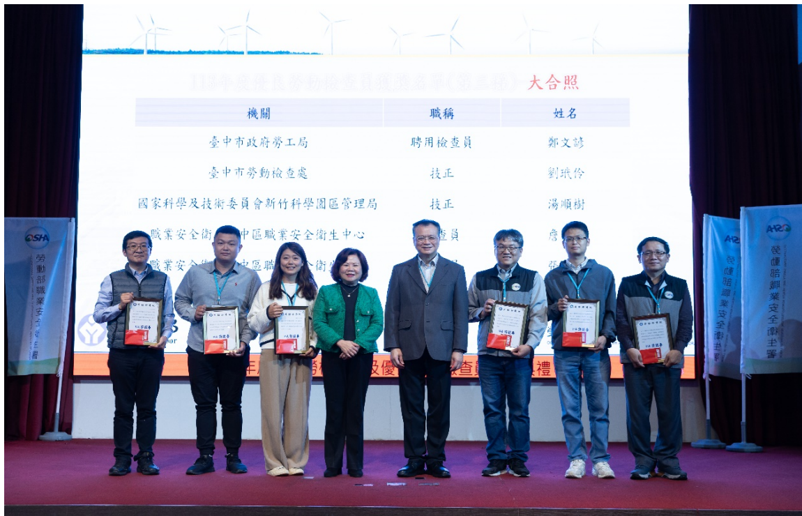
Image 3: Minister Hsu Ming-Chun and Director-General Tzou Tzu-Lien of the OSHA presenting awards to outstanding inspectors.