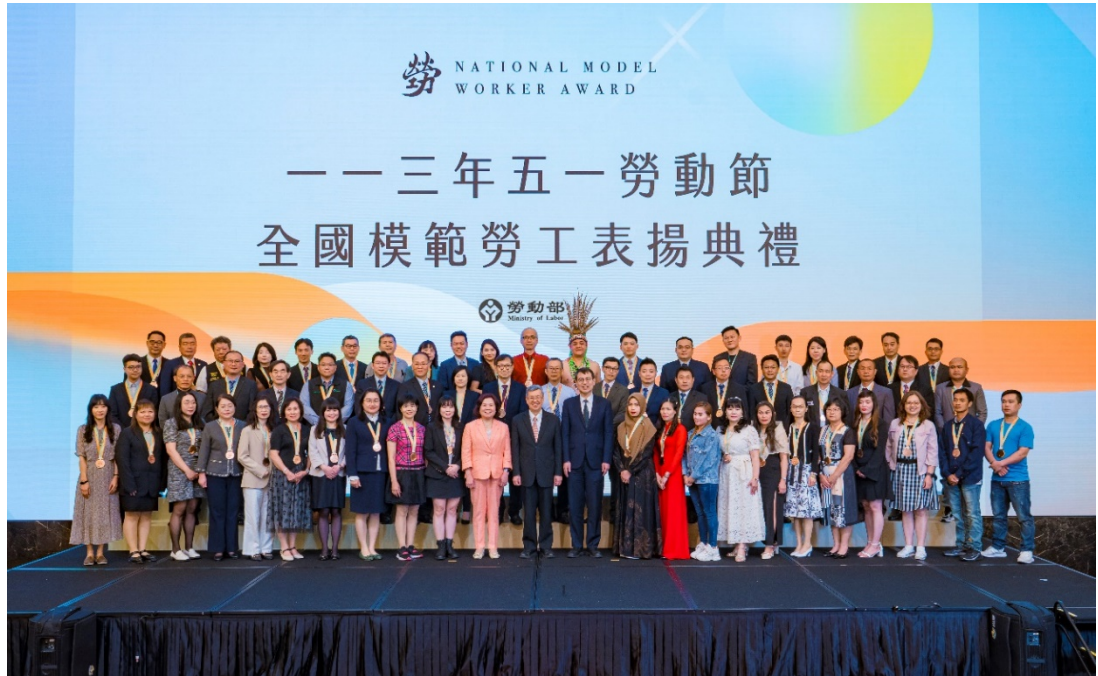
Image 6: Former Premier Chen Chien-jen (center) with former Minister of Labor Hsu Ming-chun (center left) and 61 national model workers (including migrant workers) in a group photo.

To commemorate Labor Day, the MOL held the "2024 Labor Day National Model Worker Award Ceremony" at the Grand Hilai Taipei on April 29, 2024 to recognize the efforts and contributions of workers (including migrant workers) to national development and socio-economic progress.