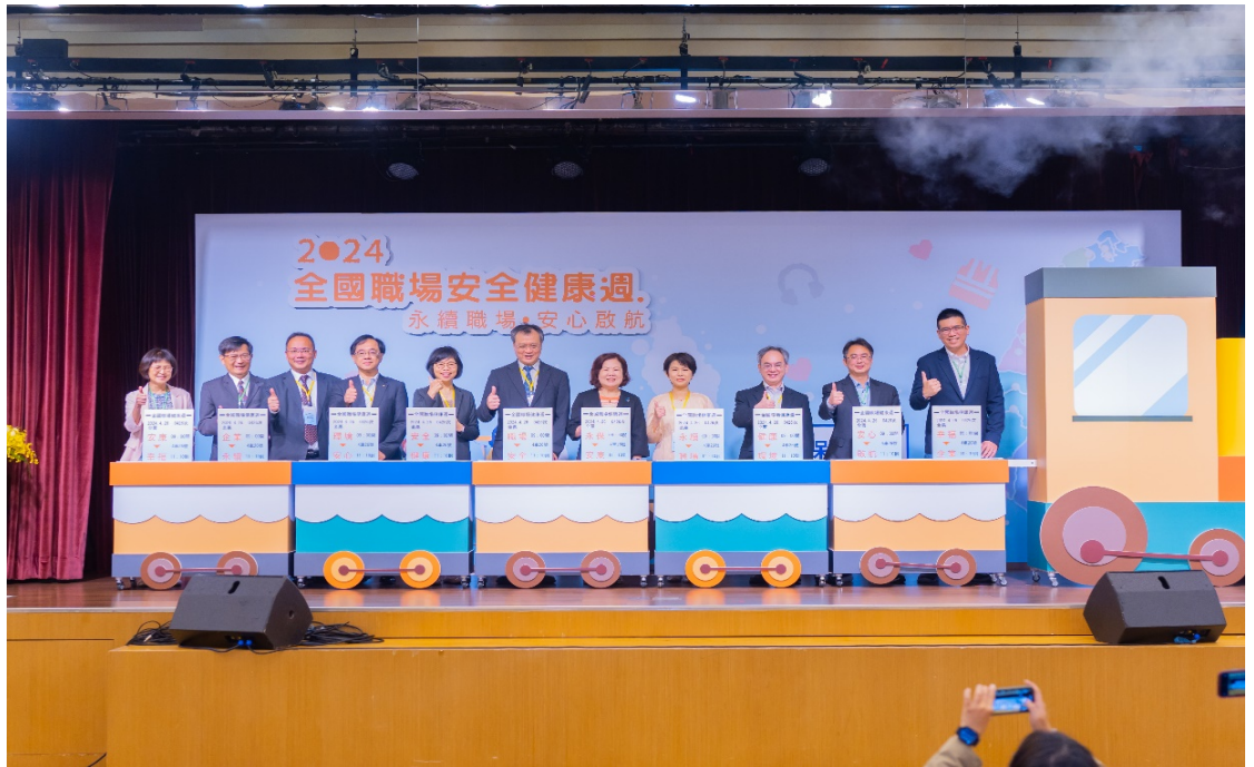
Image 4: Pledge activity for the 2024 National Workplace Safety and Health Week.