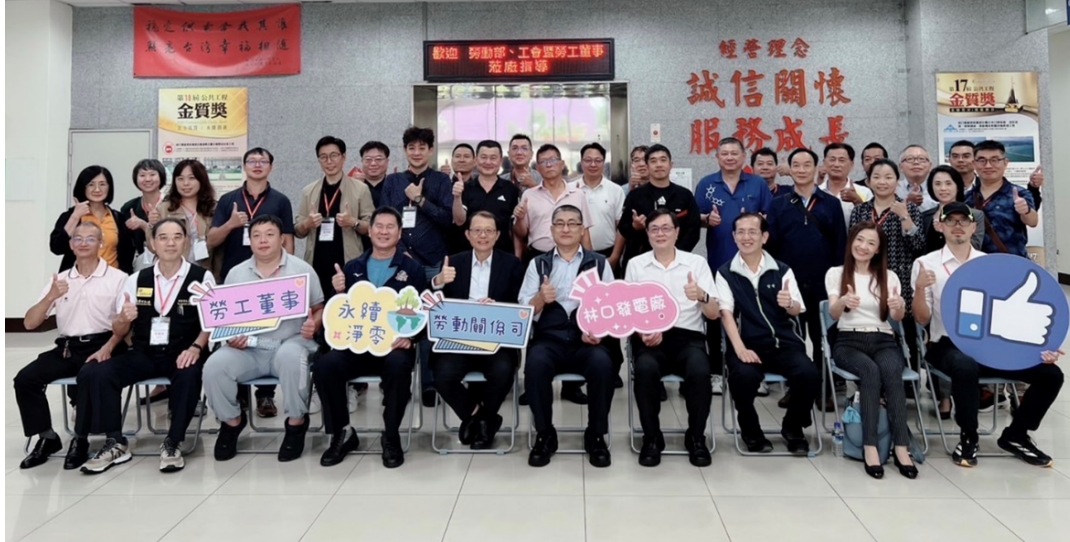
Image 7: Participants of the Labor Education Promotion Workshop visiting Taiwan Power Company's Linkou Power Plant.

Directors" was conducted to strengthen participants' understanding of economic and industrial strategy analysis, corporate governance, board member responsibilities, and financial supervision. This year's program also included sustainability, net-zero transition, and just transition courses. As part of the workshop, attendees visited Taiwan Power Company's Linkou Power Plant to gain insights into its energy-saving and low-carbon emission initiatives.