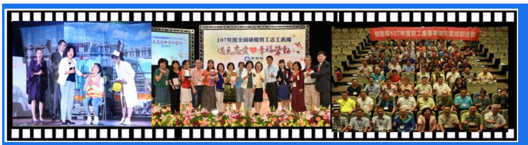
Picture 4: Minister Hsu of the Ministry of Labor attended the "Strengthening Labor Concept - Campus Tour Training Activity" held at the Keelung Municipal Zhong Shan Senior High School. For the stage show Complete Work Strategy , she was a guest performer acting as Minister of the Ministry of Labor going to a hospital and expressing her caring to an injured student working as a part-timer and asked the boss to protect laborers' rights and interests.

Sept.27-29, 2018 With its invention patents of "Powder Dispenser and Its System" and "Stair Climbing Auxiliary Carrying Machine and Its Expansion Module", Institute of Labor, Occupational Safety And Health, Ministry of Labor participated in the patent invention competition for the 2018 Taiwan Innotech Expo held by the Ministry of Economic Affairs at the Exhibition Hall 1 of Taipei World Trade Center and won 1 gold and 1copper awards. (Picture 9)