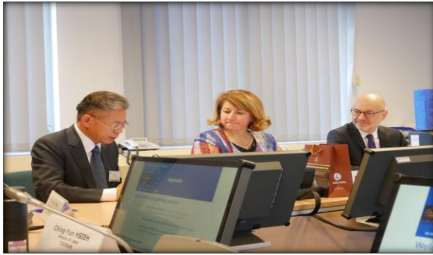
Graph 1: The 1 st Taiwan-EU Labor Consultation held at the the European Commission's Directorate General for Employment, Social Affairs and Inclusion.