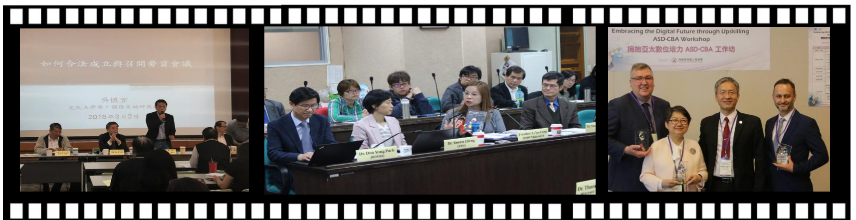
Picture 4: Joint discussion activities of 2018 Ministry of Economic Affairs and Ministry of Labor promoting the Labor-Management Conference.

31.03.2018 In order to protect the labor rights of workers who have applied for labor pension and are engaged in work again, monthly compared the labor insurance and labor pension data from this month, and for the first time sent notification to insured units, who contributed labor pension for workers only and did not participate in occupational Injury Insurance, may apply to participate in occupational Injury Insurance. A total of 4,840 units are notified.