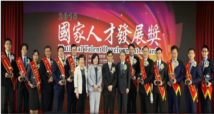
Graph 5 : Executive Yuan’s Minister without Portfolio Lin, Minister Hsu, Deputy Minister Lin, and WDA Director-General Huang along with the “National Talent Development Award” winners.