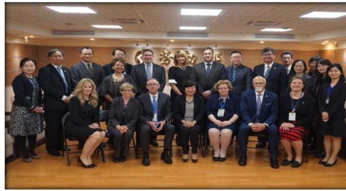
Graph 6 : Minister Hsu met with the US Federal and State Labor Officials Delegation and exchanged opinions on labor issues.

05.11.2018 With the adjustment of basic wage, amended and promulgated "Insured Salary Grading Table of Labor Insurance". The amendment adjusted the 1st grade insurance salary into NTD23,100, and took effect on January 1, 2019.