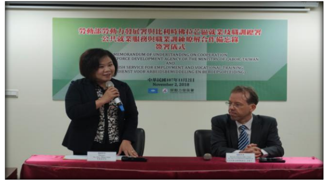
Graph 2 : MOL Workforce Development Agency concluded an “MOU on Public Employment Service and Occupational Training” with the Belgium’s Flemish Service for Employment and Vocational Training (VDAB). Minister Hsu witnessed the MOU signing and delivered remarks.