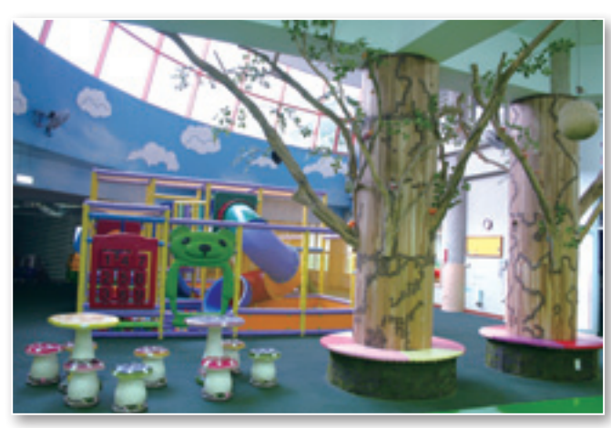
The government actively provides guidance to help enterprises establish nurseries for employees' children.

To encourage companies to organize childcare services, the Council of Labor Affairs amended the "operation guidelines for subsidy for childcare facilities and measures" on June 5, 2012 by the addition of the "joint childcare" subsidy project. Companies with childcare facilities can sign contracts with other companies to receive the children of employees. Participating companies